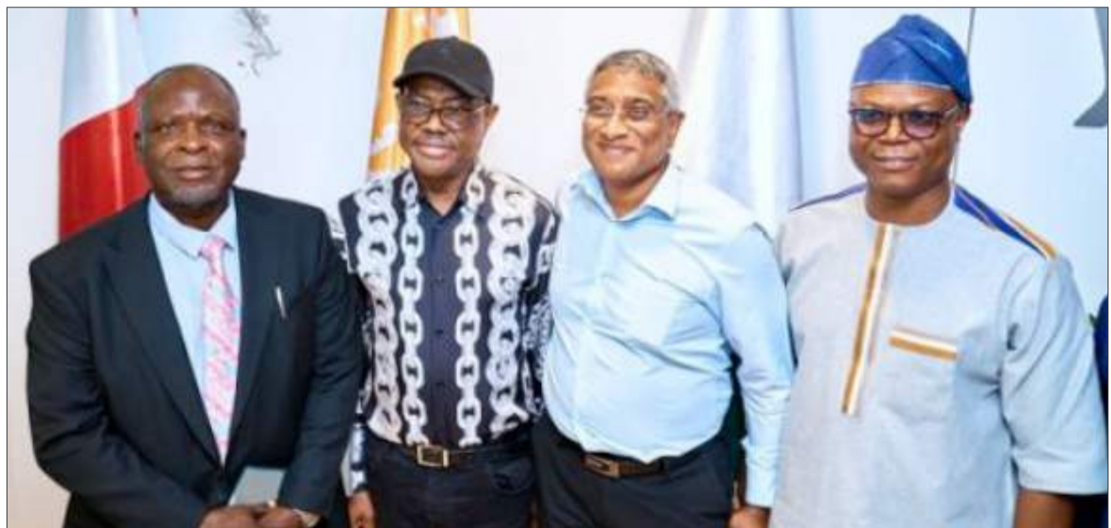
Minister Nyesom Wike, Federal Capital Territory (FCT) Minister

The projects are being executed by the Federal Capital Territory Administration through the Federal Capital Development Authority, with