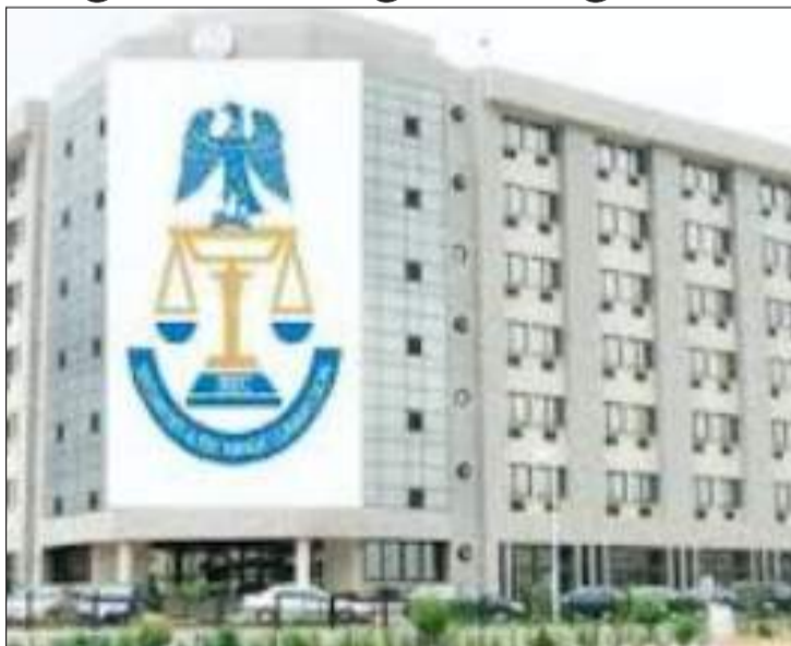
Securities and Exchange Commission (SEC)