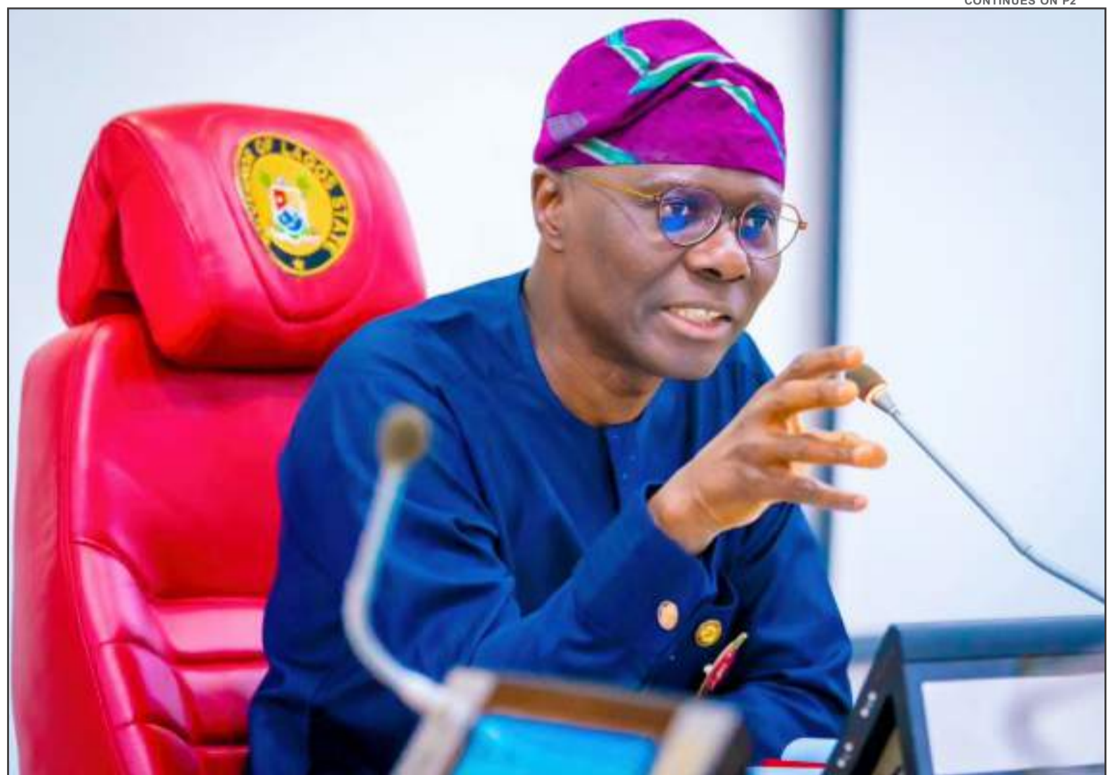
Governor Babajide Sanwo-Olu - Executive Governor, Lagos State