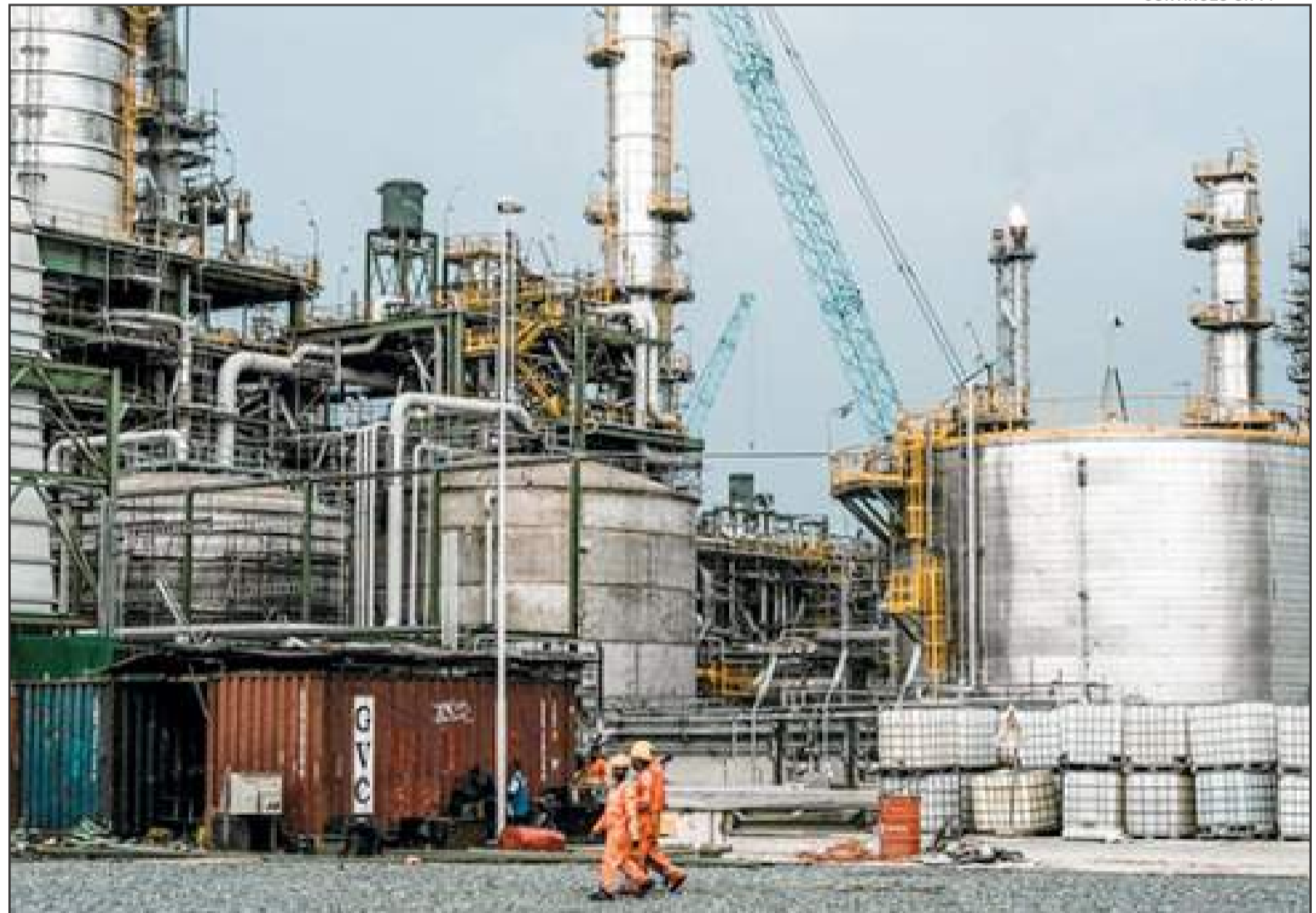
The Dangote Refinery