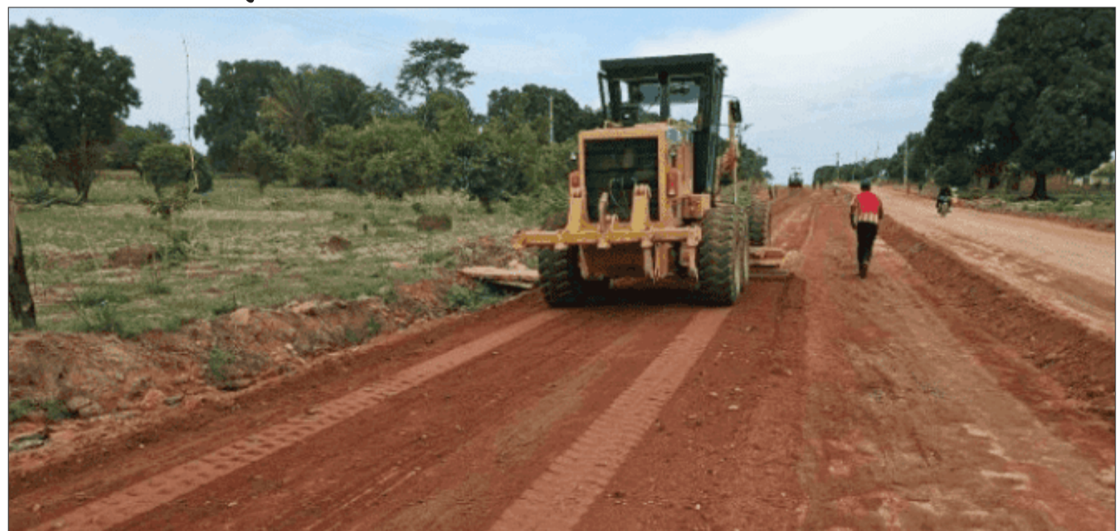
Katsina-Ala-Takum road project

He also lamented the Benue Government's ban on blasting of rocks, which he said has grossly affected the progress of the contract,