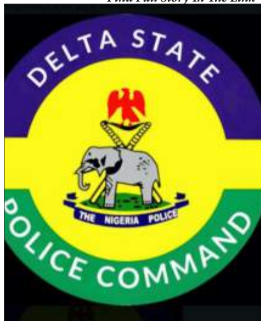
Delta State Police Command