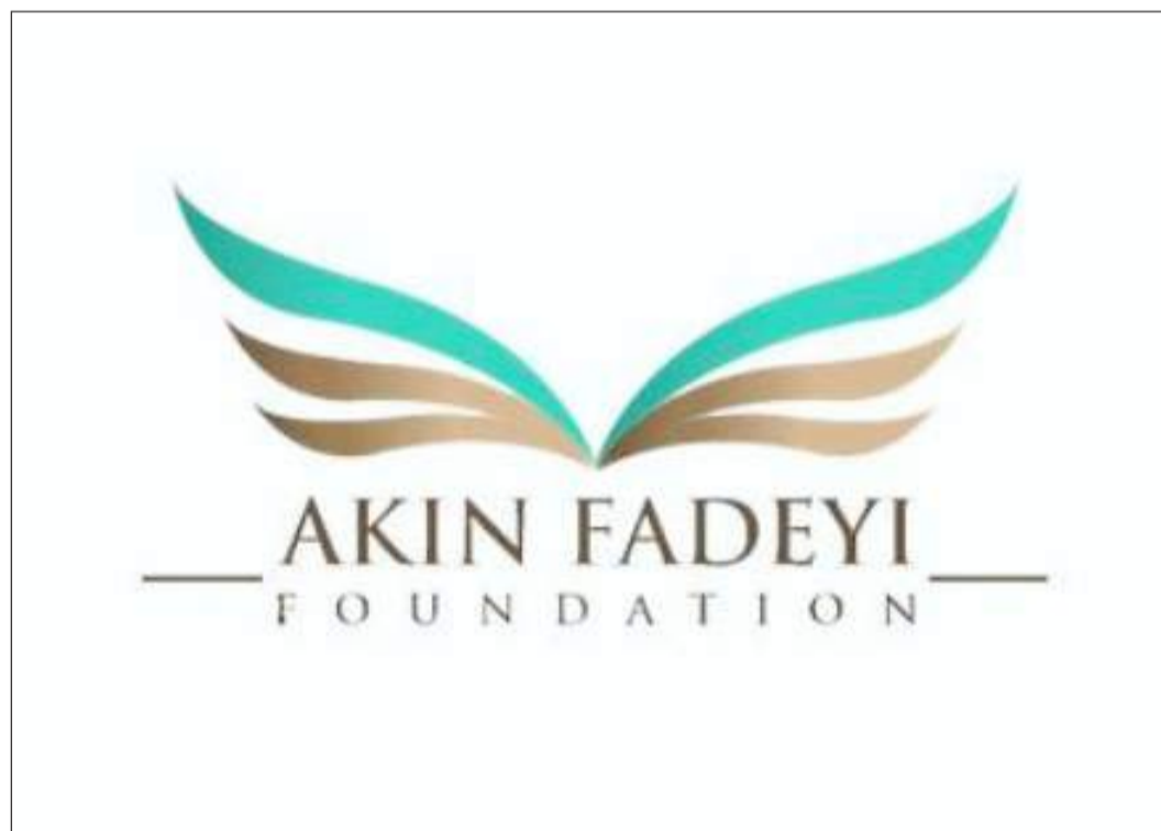
Akin Fadeyi logo

10,000 crashes, nearly 39,000 casualties and more than 5,000 deaths within a reporting period, describing them as "unfinished stories and extinguished potentials."