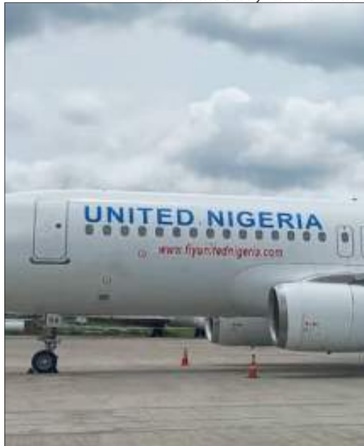
United Nigeria airline