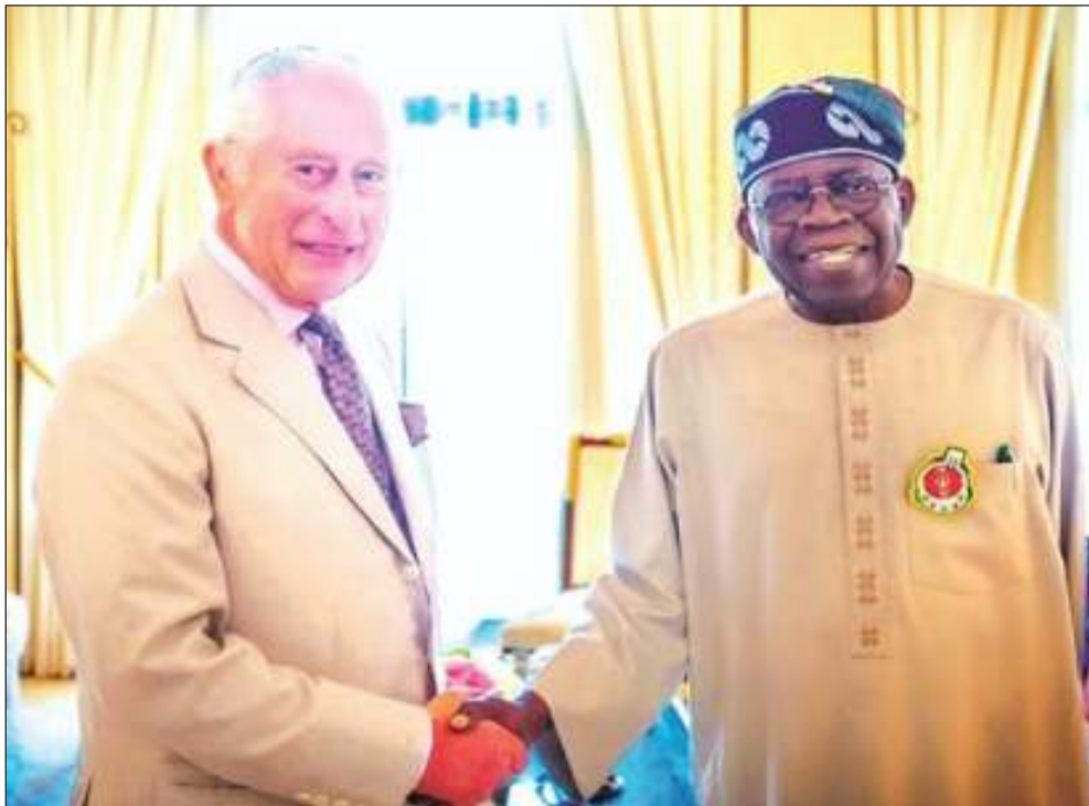
Tinubu with King Charles III