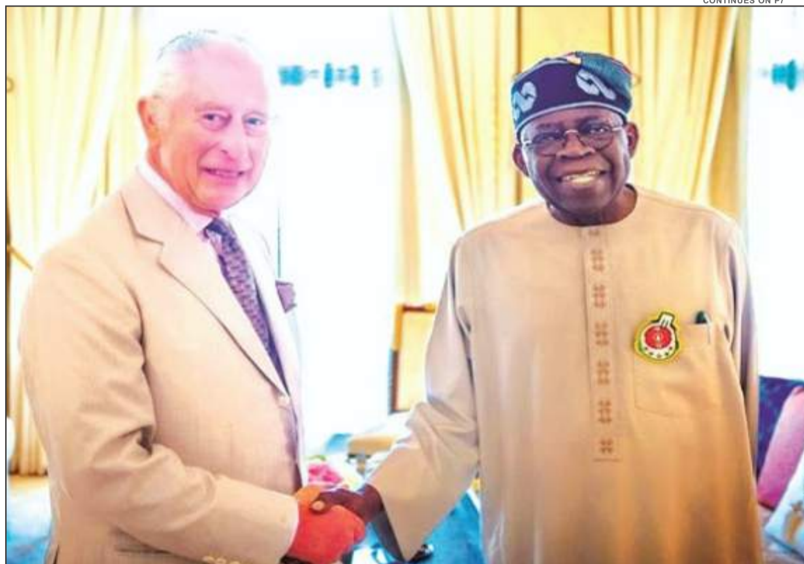
President Bola Tinubu with King Charles III ahead of his visit to the UK