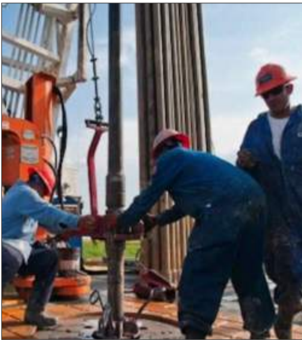
Crude oil refinery

The Crude Oil Refinery Owners Association of Nigeria has called for the adoption of a domestic crude oil pricing framework that would allow local refineries to access crude at more realistic prices, saying such a move would help stabilise fuel costs and shield Nigerians from global oil market volatility.