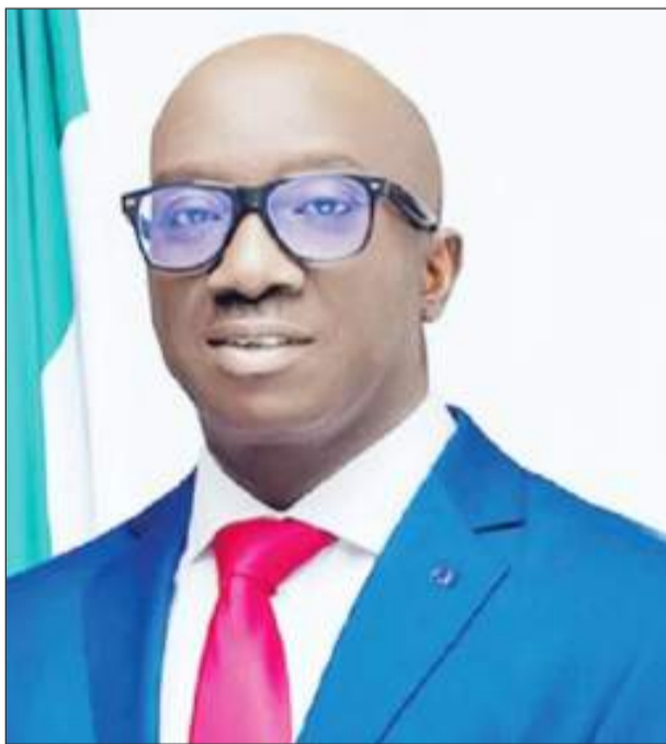
Governor Monday Okpebholo

The Governor of Edo State, Monday Okpebholo, has directed contractors handling road construction projects across the state to work round the clock to mitigate the impact of the approaching rainy season, which could slow the pace of ongoing works.