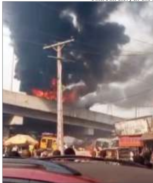
the fire on the BRT bus