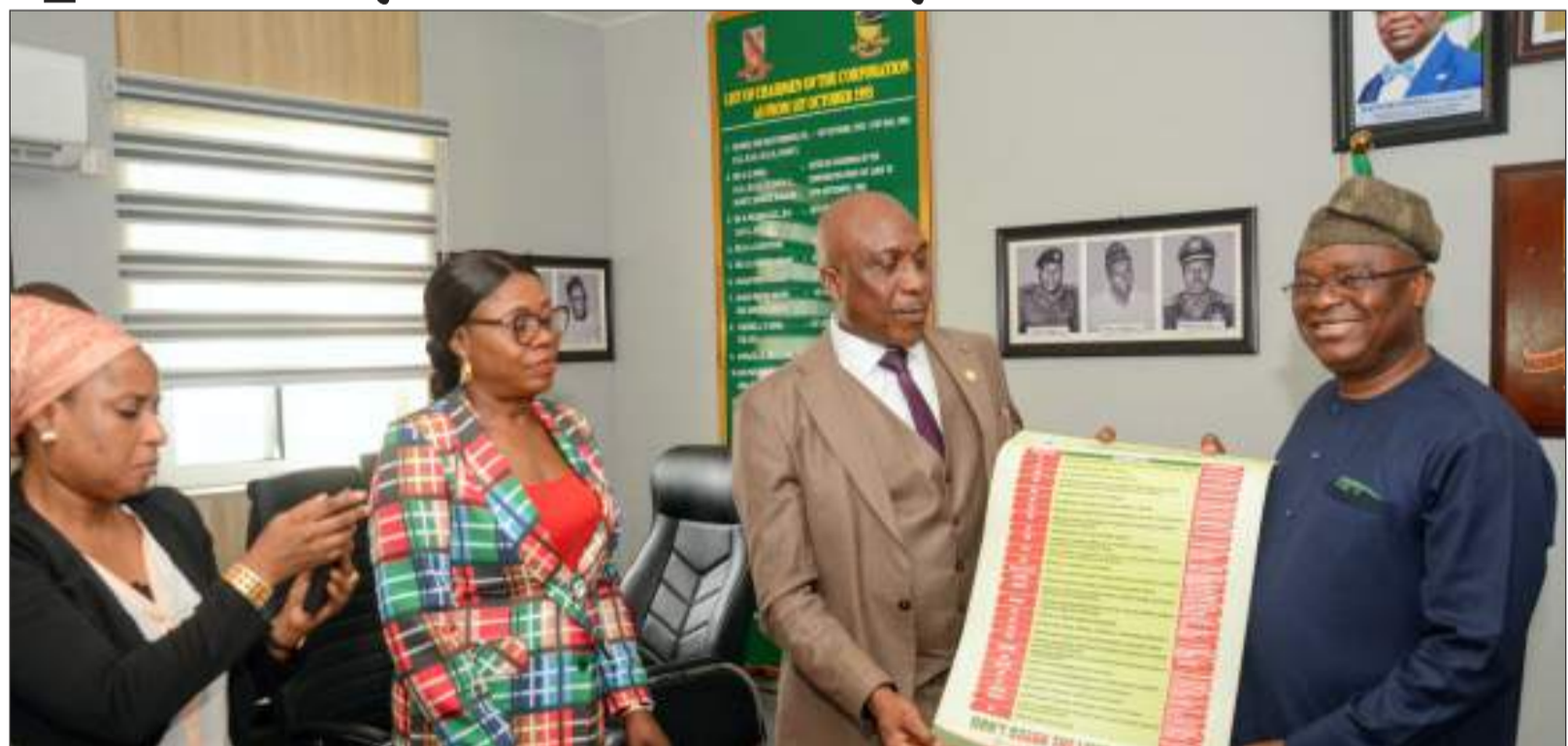
ICPC partners NRC

He noted that the initiative aligns with the Commission's public education mandate, which seeks to promote integrity across public institutions.