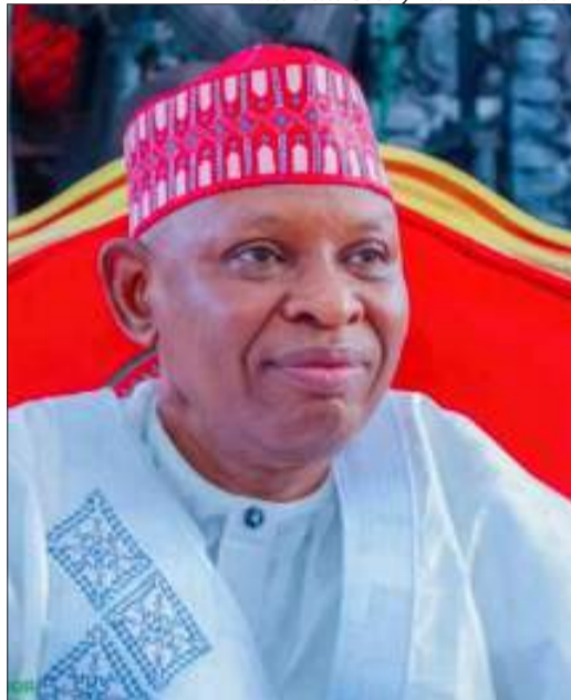
Governor Abba Yusuf