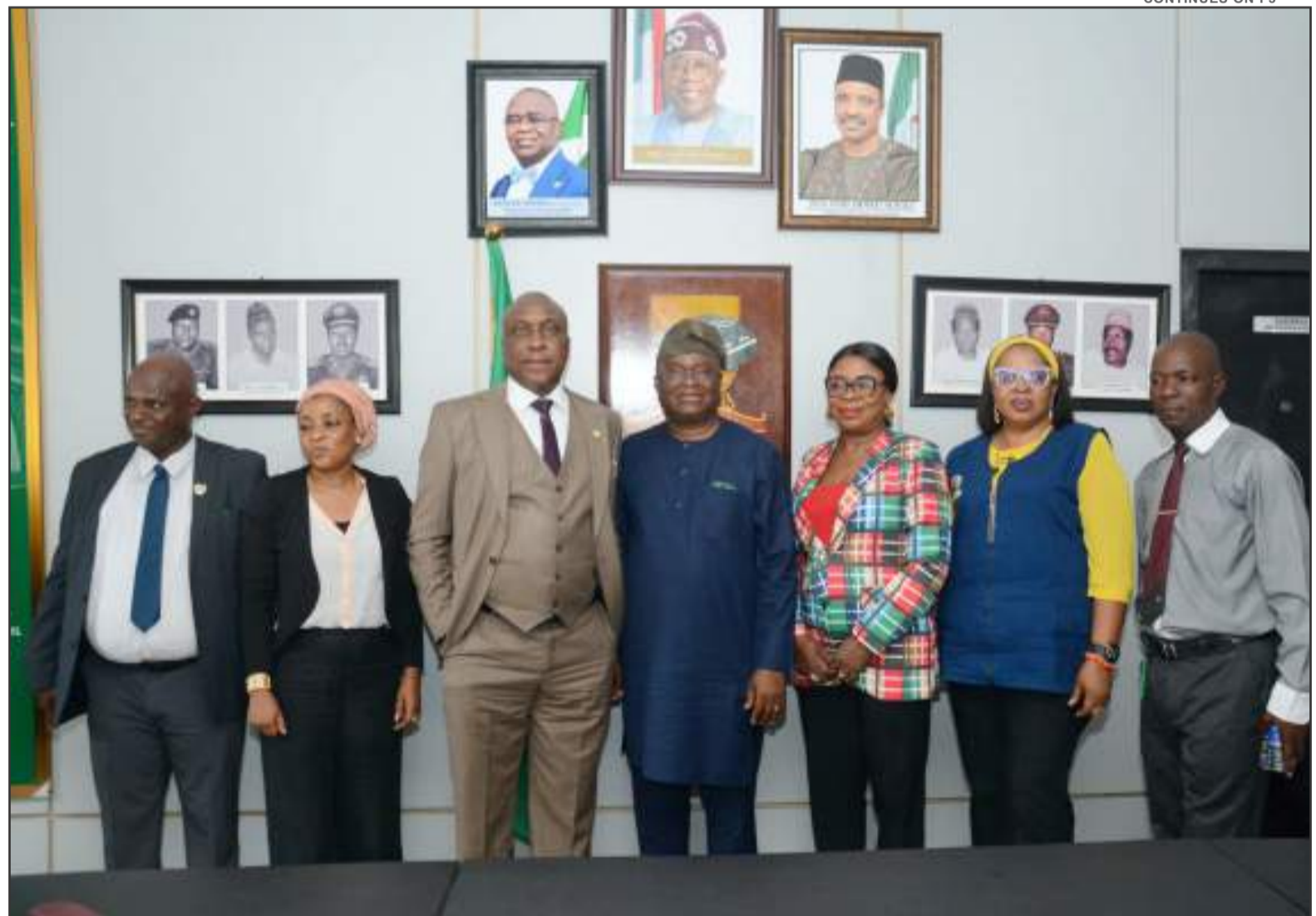
ICPC partners NRC on railway sector