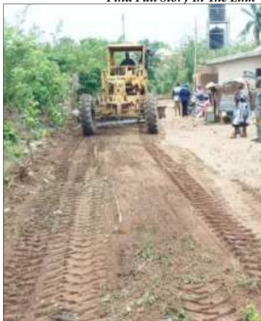
Olorunda road rehabilitation