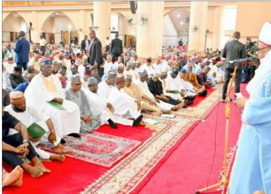
President Tinubu at the National Mosque, Abuja

Culled: President Bola Ahmed Tinubu has expressed optimism that Nigeria will overcome its current economic difficulties, assuring citizens that the nation remains resilient despite the harsh impact of global developments, particularly the ongoing conflict in the Middle East. The President gave the assurance on Sunday after a special prayer session held in his honour at the National Mosque, Abuja, as part of activities marking his 74th birthday. President Tinubu acknowledged that Nigerians are facing challenges, including electricity concerns, rising transportation costs and inflationary pressures, but maintained that the country would pull through.