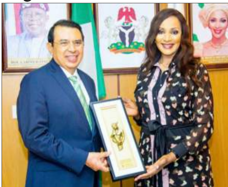
Nigeria and Mexico set to deepen bilateral ties

Culled: Nigeria and Mexico are set to strengthen their diplomatic and economic relations through a renewed commitment to high-level ministerial exchanges, as both countries explore new avenues for cooperation