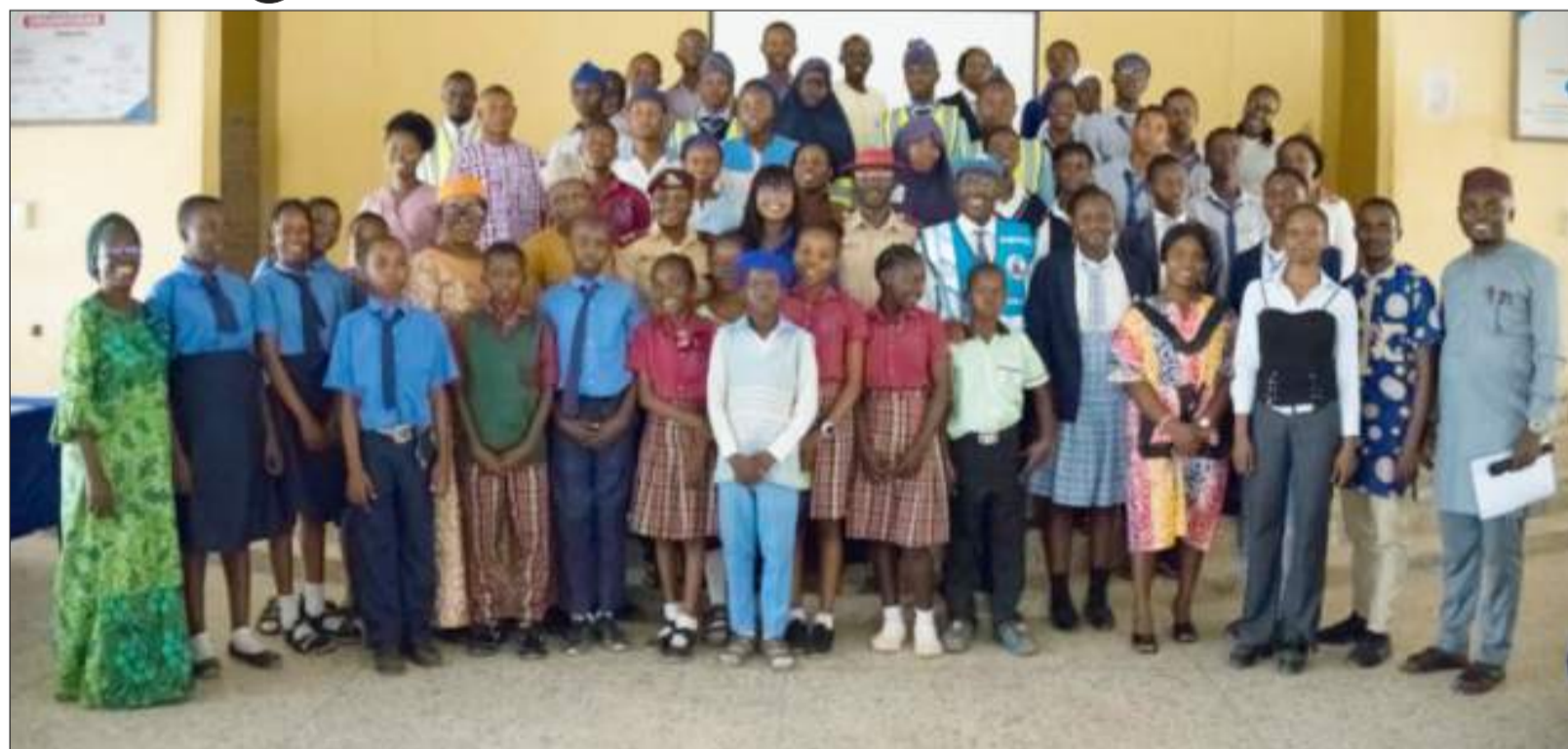
Students empowered with road safety skills in Abuja

"The initiative forms part of the High Impact Phase of the programme, following the emergence of Government