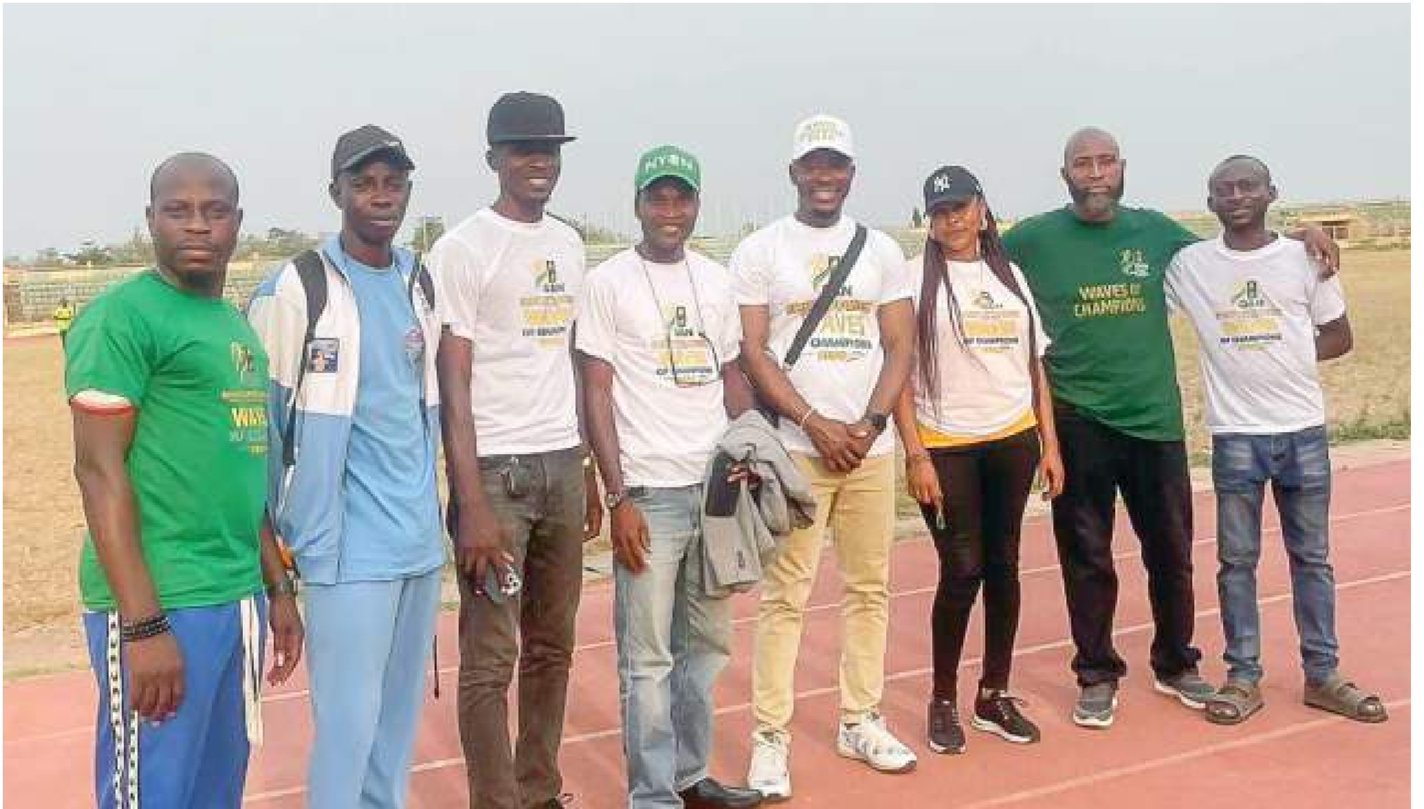
Q & N Sports Development