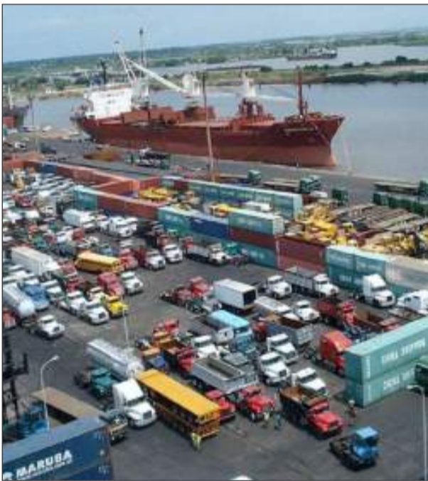
Tinian island port

The Nigerian Ports Authority (NPA) at the weekend unveiled a comprehensive strategy to boost Nigeria's non-oil exports, anchored in infrastructure renewal, export process simplification, and the full automation of port operations.