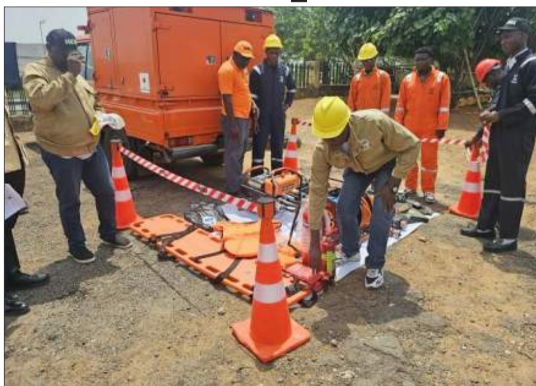
FRSC, NEMA trains officers in Osun

Also, four members of the FRSC Unit 29 Special Marshals, three tow-truck operators, 4 personnel of Osun Emergency Medical Services and Ambulance Systems, and representatives of partnering hospitals and medical practitioners within