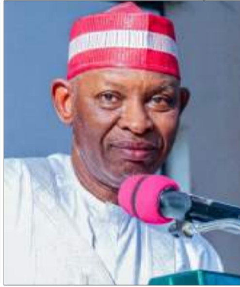
Governor Kabir Yusuf