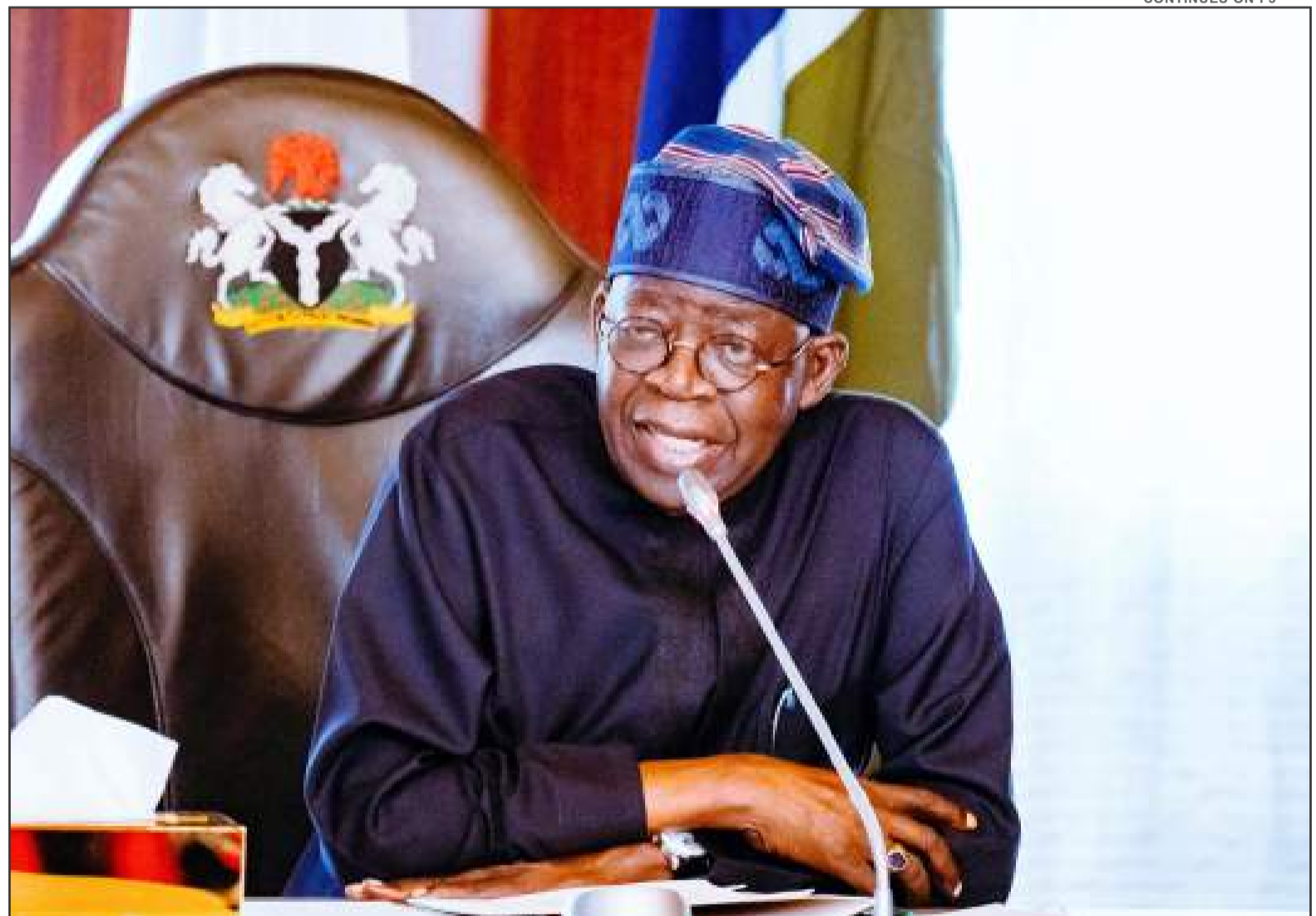
President Bola Tinubu - President, Federal Republic of Nigeria