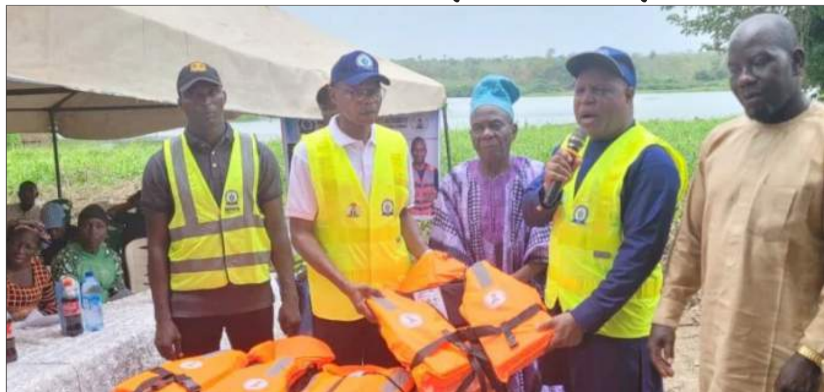
NIWA Ogun State distributes life jackets

each year due to preventable accidents, often caused by negligence.