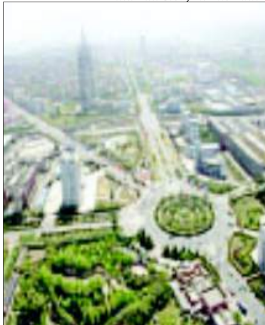
Port Harcourt city