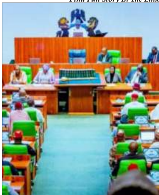
House of Reps