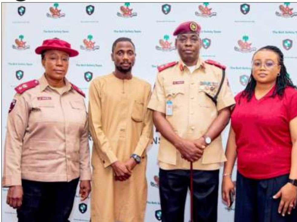
Bolt and FRSC hold safety training for Ride-Hailing drivers

Bolt said the programme forms part of broader efforts to strengthen safety awareness among professional drivers