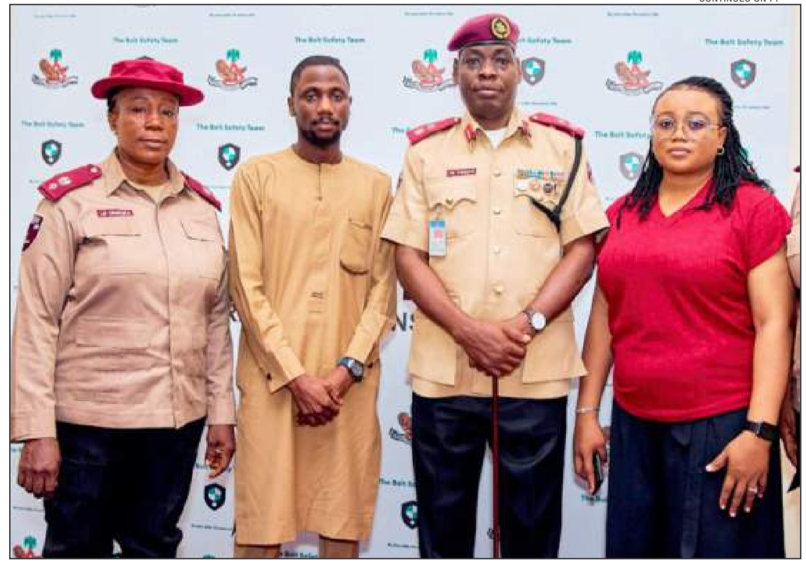
Bolt, FRSC hold safety training for ride-hailing drivers