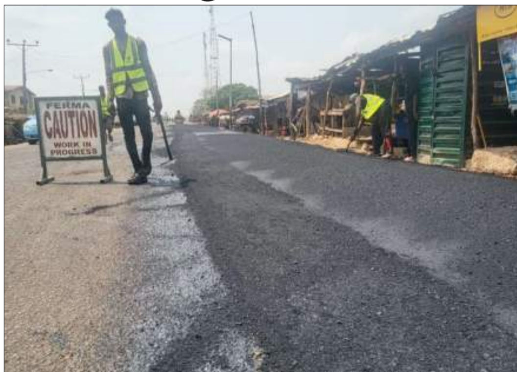
Rehabilitation of roads in Oke Ogun

"The state of the roads in the Oke-Ogun area is appalling. The situation has resulted in a geometric increase in the prices of commodities as well as in the