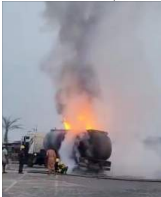
The burning tanker