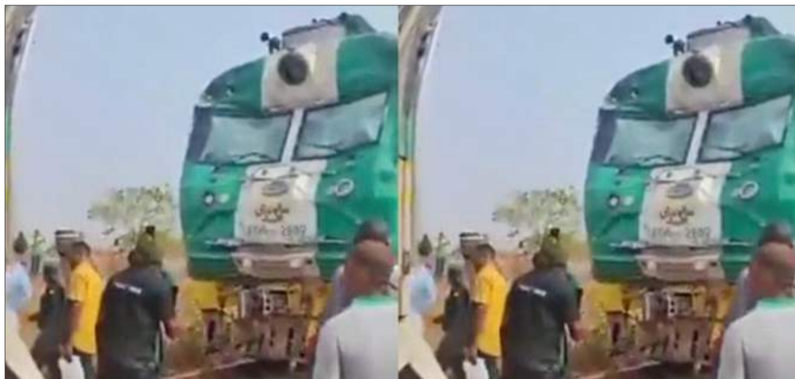
The train collision

The statement reads: "The Management of the Nigerian Railway Corporation (NRC) wishes to confirm that an avoidable train incident occurred at about 10:30 a.m. today near Asham, involving a rear locomotive and a passenger coach.