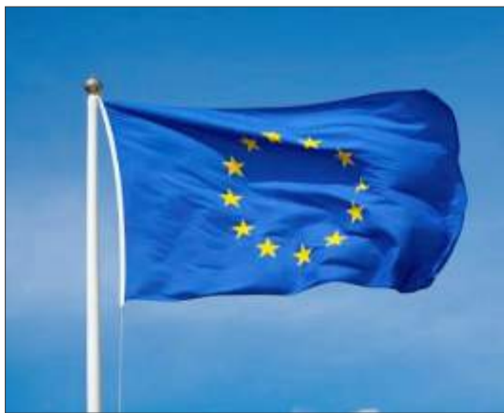
The European union

Culled: The European Union on Monday unveiled a €290 million investment package for Nigeria, marking a significant upgrade in bilateral relations and signalling a push to increase investment in alignment with the Nigerian Federal Government's Renewed Hope agenda. The funding will support seven new operations spanning digitalisation, health, agricultural value chains, and migration management, according to a statement by Mr. Modestus