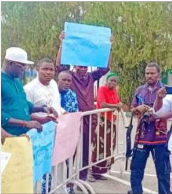
Residents of Ofagbe community

Residents of Ofagbe Community in Isoko North Local Government Area of Delta State have staged a protest over the prolonged delay and alleged poor execution of the 24-kilometre Isoko Ring Road project, calling on Governor Sheriff Oborewori to revoke the contract awarded to Dora-Dan Global Resources.