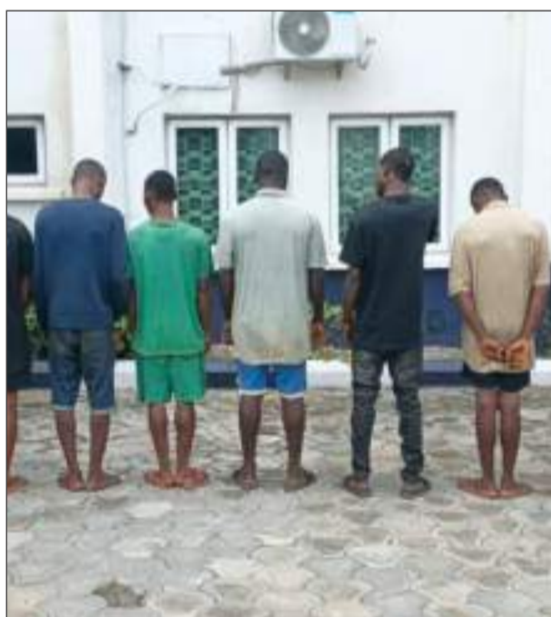
The suspected oil thieves

The Nigerian Navy Ship, Pathfinder, in Port Harcourt, said its men have arrested eight suspected oil thieves and confiscated 44,000 litres of illegally refined Automotive Gas Oil in Rivers State.