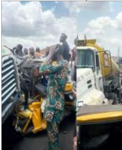
The truck accident