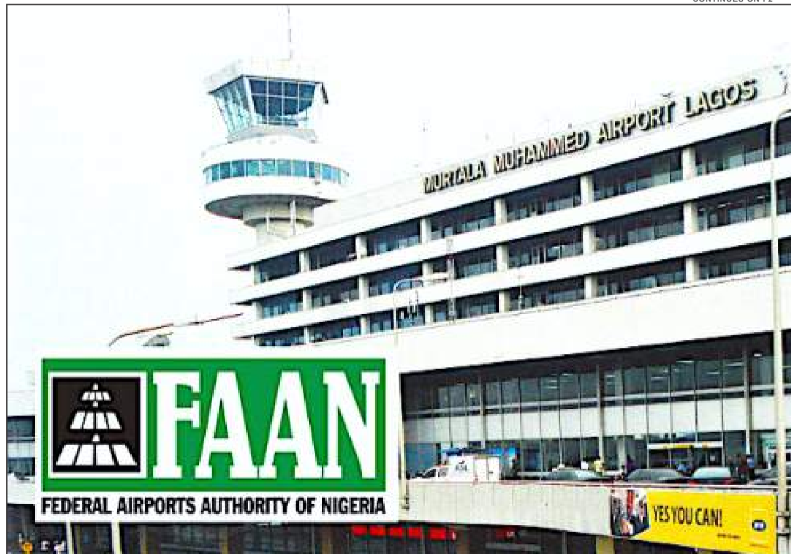
Federal Airports Authority of Nigeria (FAAN)