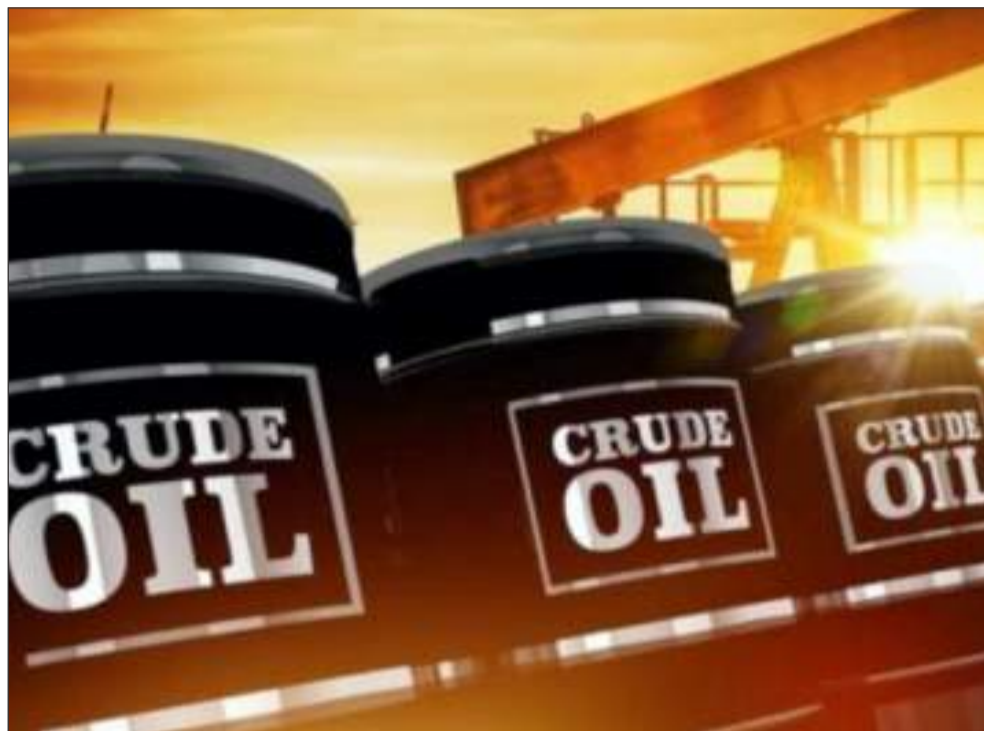
Crude oil barrels

The data underscores persistent underperformance in Nigeria's oil sector, with production consistently trailing expectations despite favourable global oil prices.