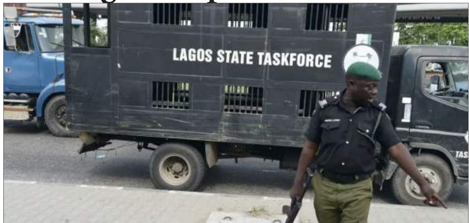
Lagos State Taskforce

During the operation, some commercial motorcycle operators were found riding on restricted routes and blocking traffic, while others were allegedly using their bikes to transport illicit drugs and flammable substances such as PMS to neighboring countries, creating