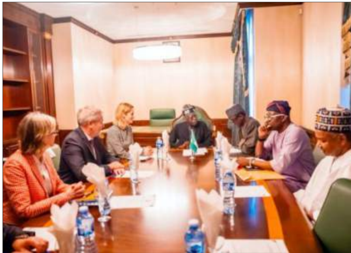
Nigeria, EU to strengthen partnership on trade and security

The meeting, which brought together key government officials, was also attended by Nigeria's National Security Adviser, Nuhu Ribadu, and the Minister of Budget and National Planning, Abubakar Atiku Bagudu. Discussions focused on strengthening cooperation across multiple sectors critical to both parties, including economic development, resource management, and regional stability. Addressing journalists after the meeting, Kallas described Nigeria and the European Union as "like-minded partners" united by shared values and a mutual interest in maintaining a stable, rules-based international order. She emphasized that in light of the increasingly complex global security landscape,