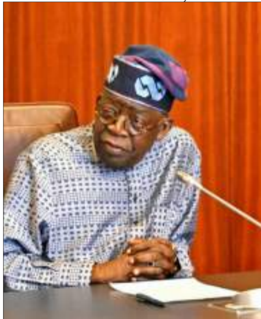
President Bola Tinubu