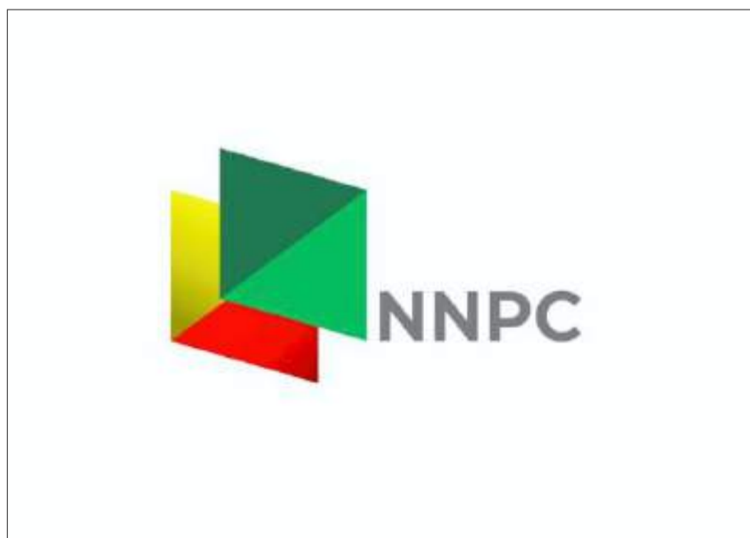
NNPC, Sonatrach sign MoU on research, Innovation in oil, gas sector

The signing took place during the opening ceremony of the 3rd Meeting of