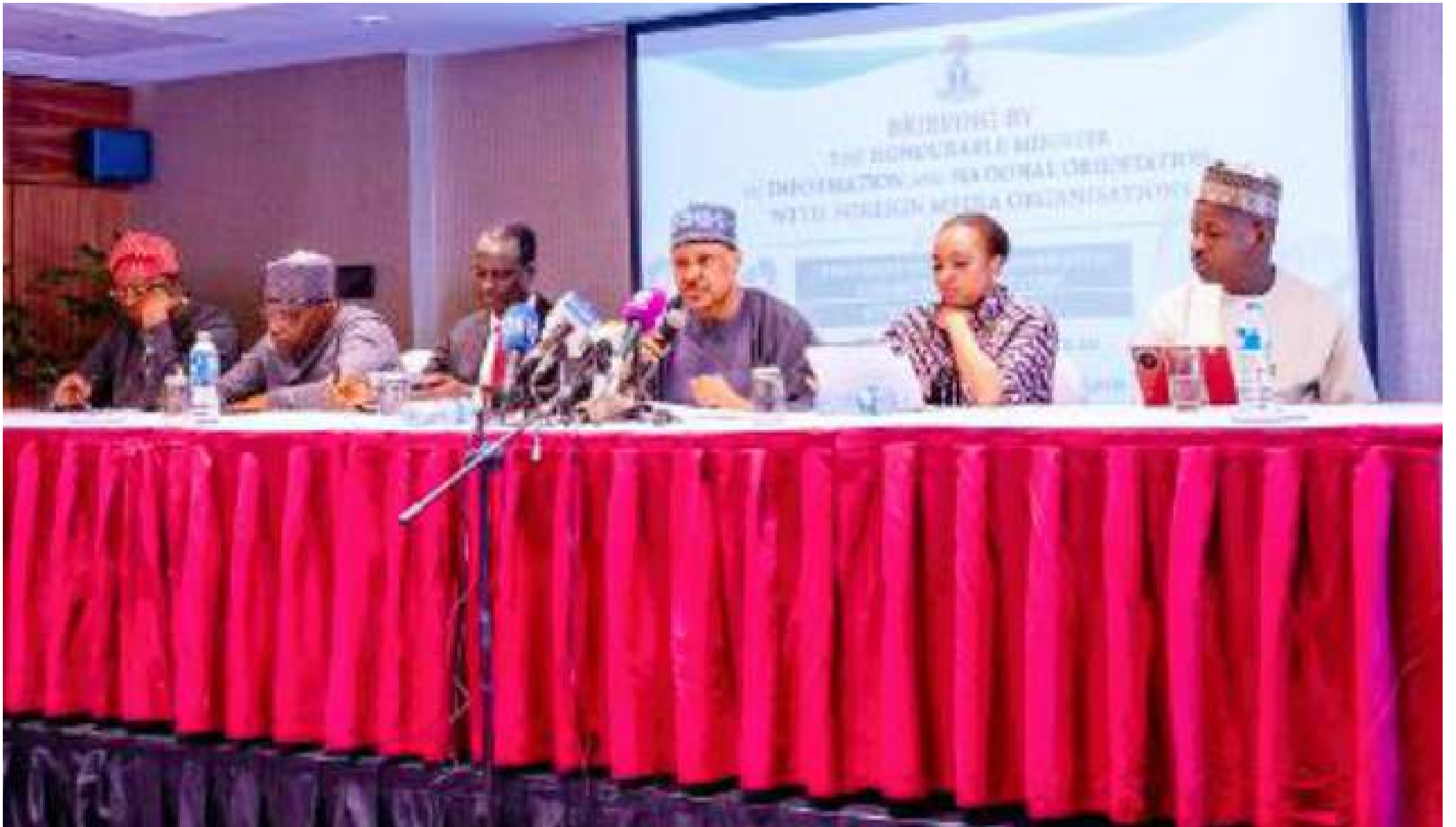
Far-Reaching reforms for economic revival