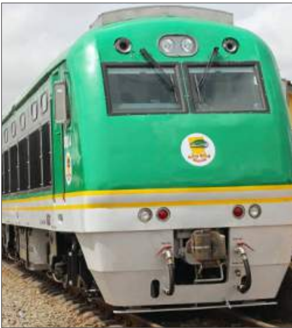
The NRC Train

Before now, railway stations served as rallying points for passengers and tourists such that development of some cities, towns and markets centred around proximity to the stations.