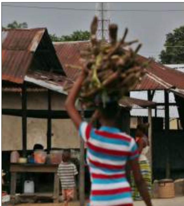
The Niger Delta region

Having waited patiently for the Asset Management Team and Sterling Global Oil Exploration and Energy Company, working with the NNPC Exploration and Production Limited (NEPL), to operationalise the Petroleum Industry Act (PIA), Delta State host communities, under OML 26, have said they have ran out of patience and are now prepared to take their destinies into their hands.