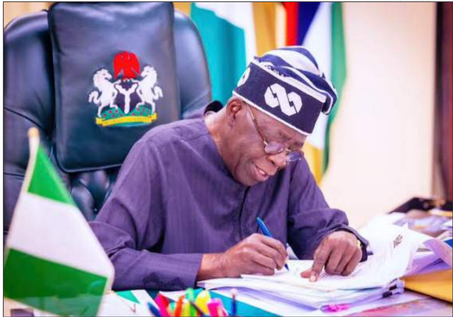
Bola Ahmed Tinubu GCFR - President, Federal Republic of Nigeria