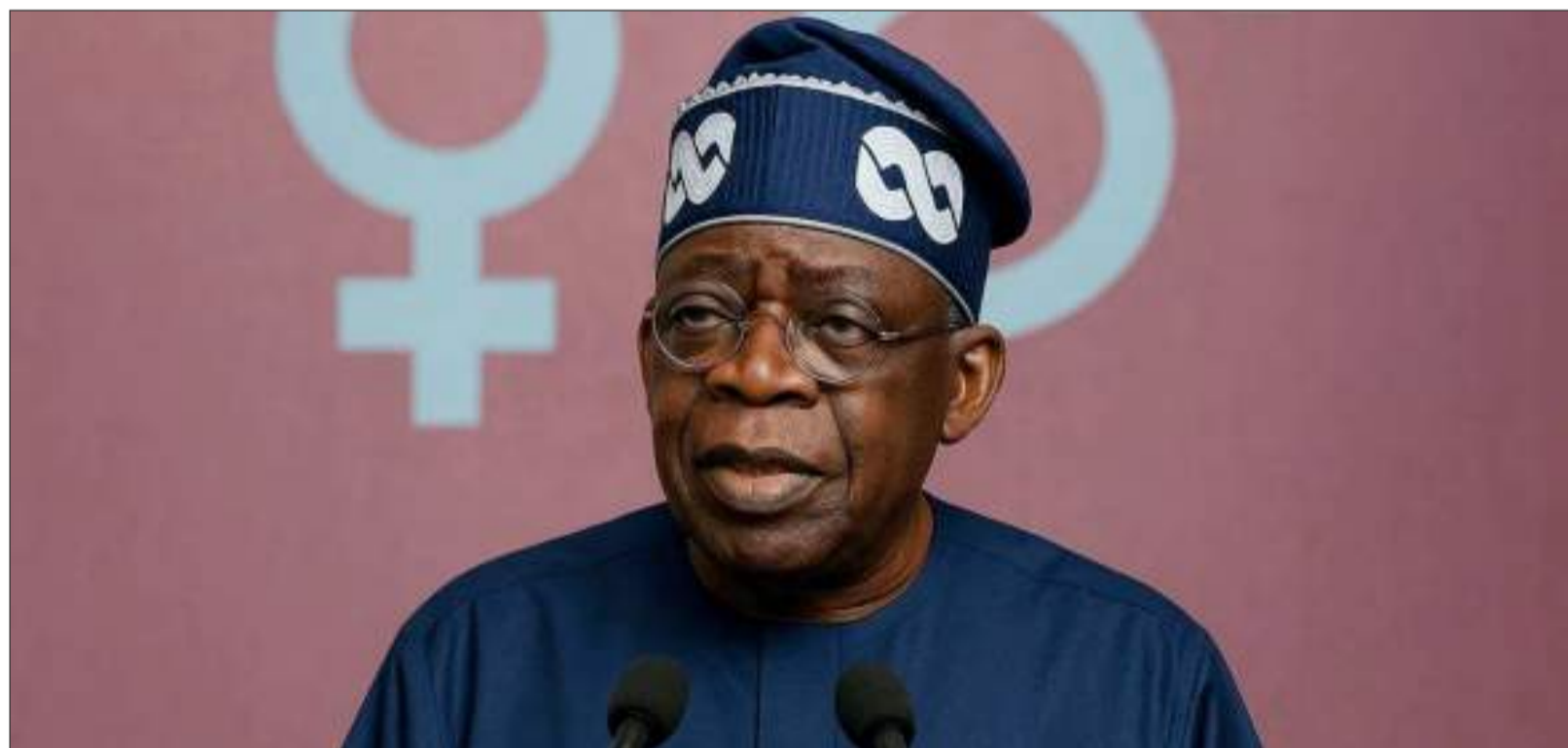
President Bola Tinubu

The Effective Implementation (EI) score of 91.45 per cent places Nigeria significantly above both the West African regional average of 61.1 per cent and