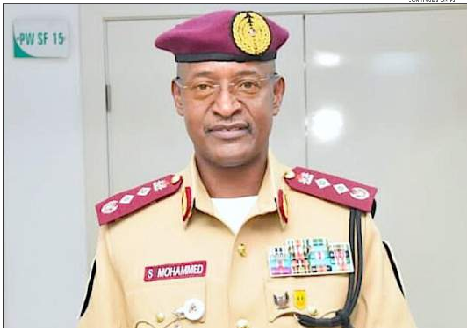
Shehu Mohammed - Corps Marshal, Federal Road Safety Corps (FRSC)