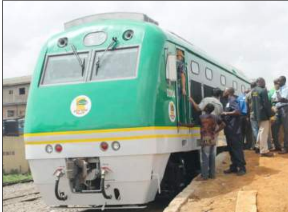
Nigerian Railway Corporation (NRC)