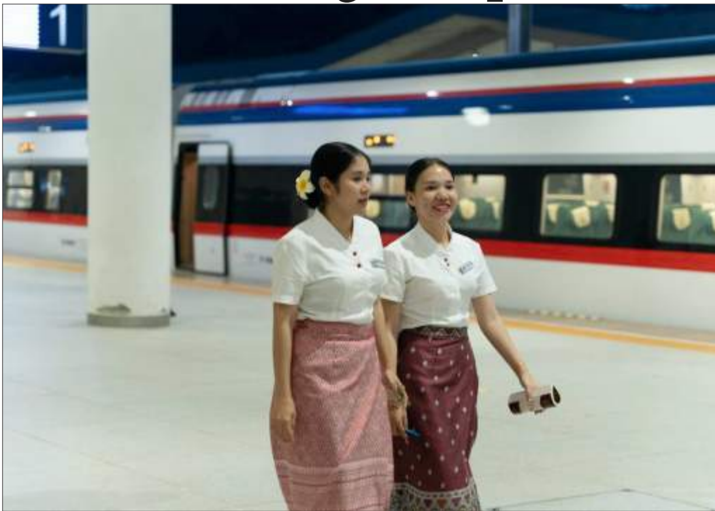
figure has increased from four to a peak of 18. So far, more than 780,000 tourists from more than 120 countries and regions worldwide have traveled across the

In response to surging demand, railway authorities from both countries have stepped up coordination to optimize services. The average daily number of passenger trains on the Chinese section has risen from eight in the early days of operation to up to 86, while on the Lao section, the