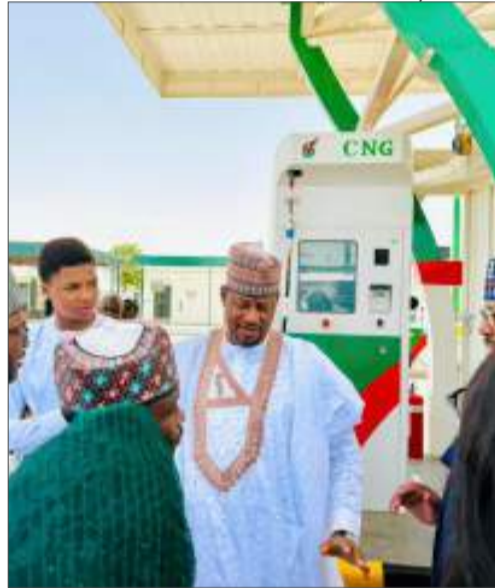
FG to establish CNG hubs in Katsina