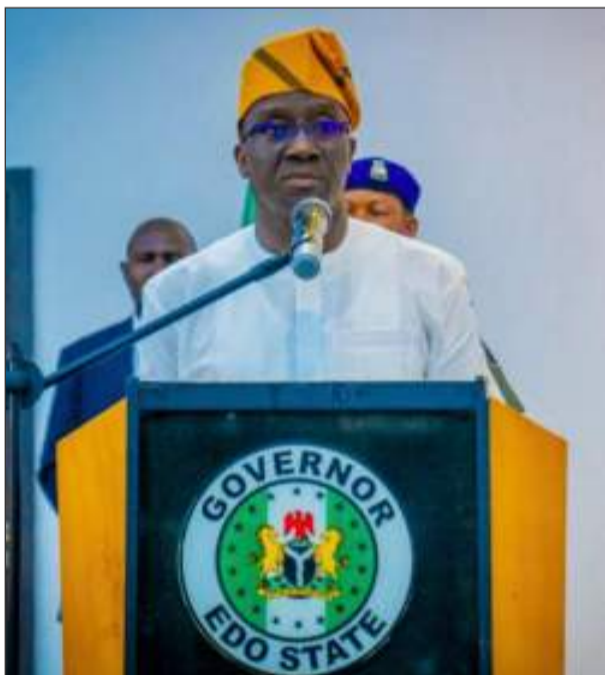
Governor Monday Okpebholo

The Edo State Governor, Monday Okpebholo, on Sunday inspected the second phase of road projects slated for construction in Edo Central, as part of efforts to expand infrastructure and open up rural communities for economic growth.