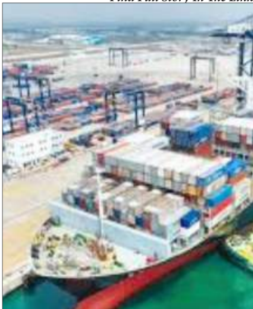
Lekki deep seaport