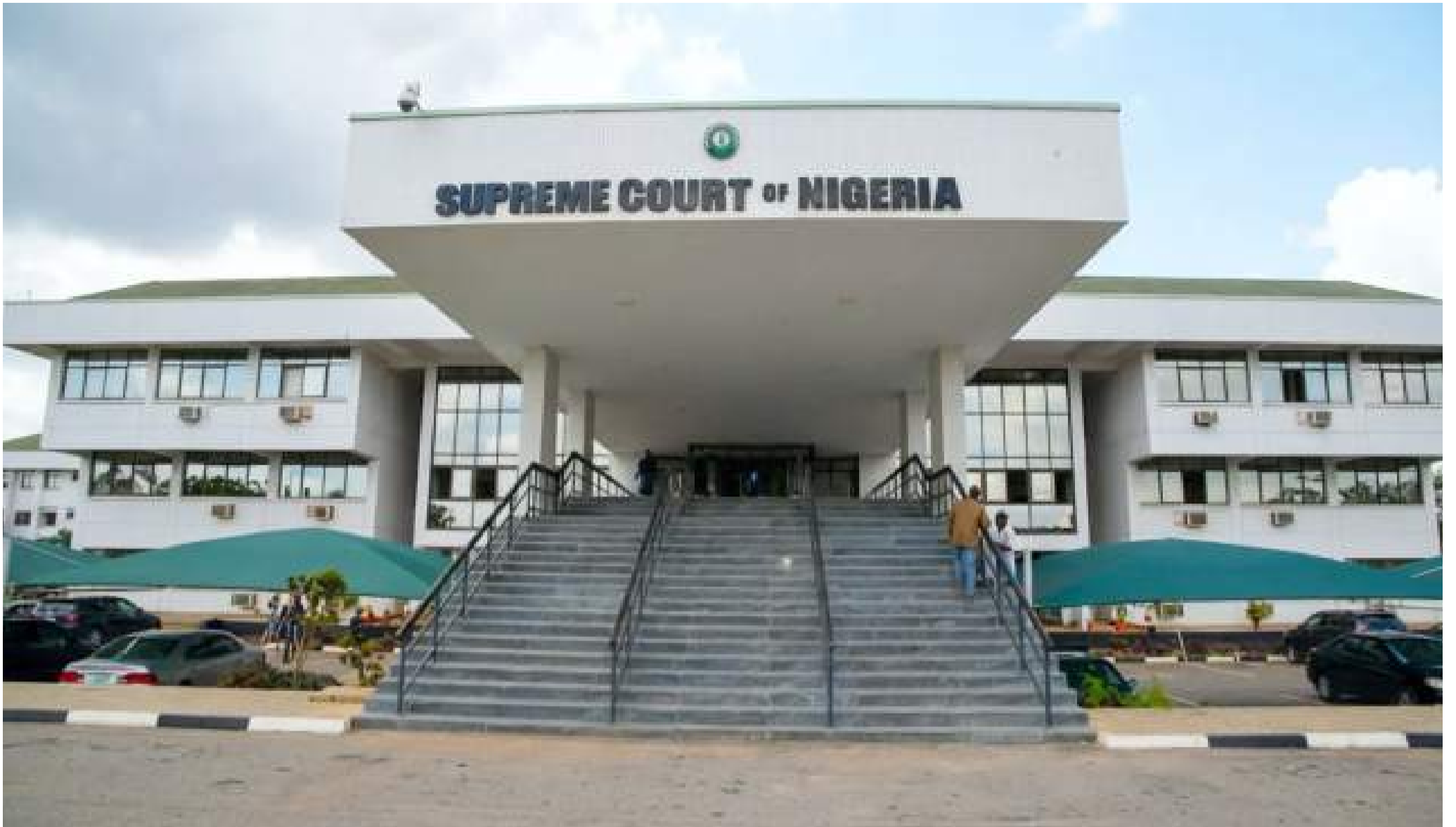
Supreme court of Nigeria