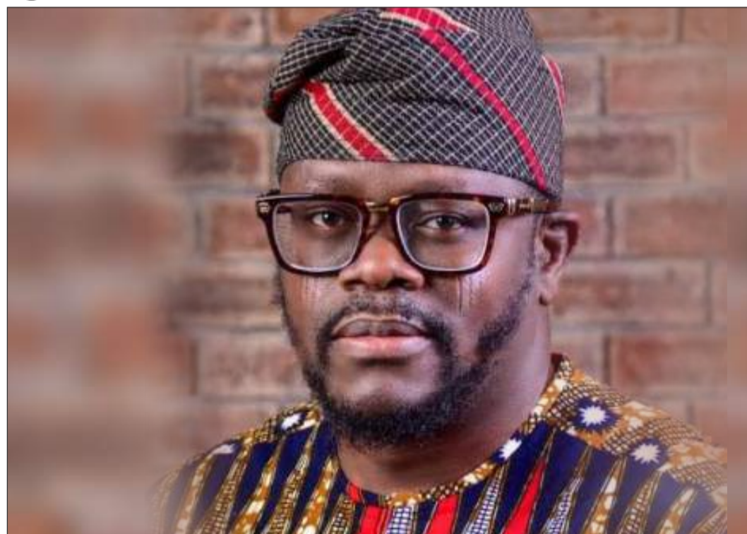
Hon. Abdoulbaq Balogun

"We are looking at the Lagos State transport policy, the effective