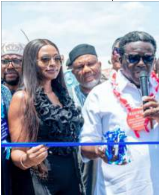
Governor Soludo commissions the Onitsha-Odekpe road