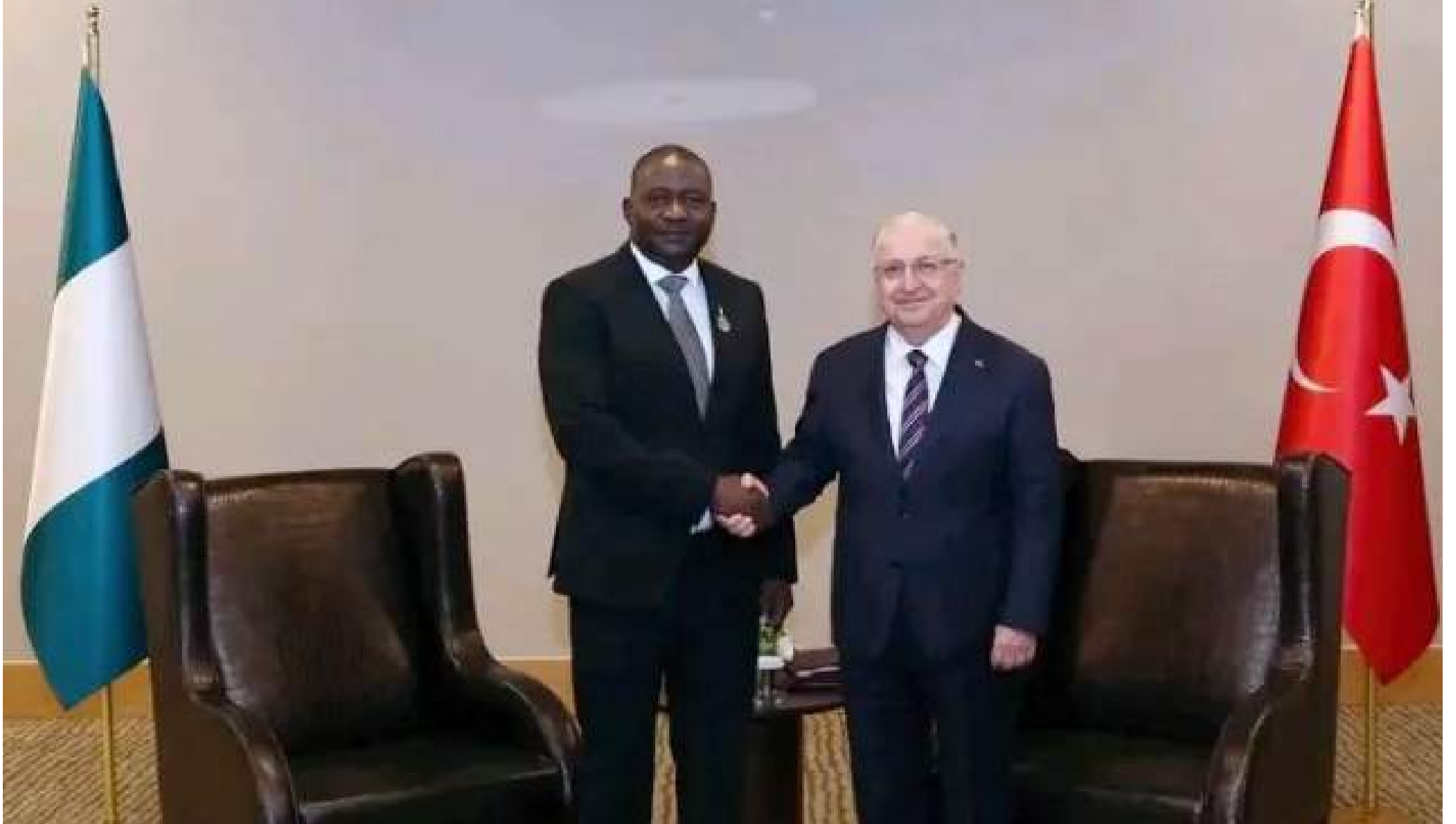
Nigeria, Turkiye sign defence pact on training, technology