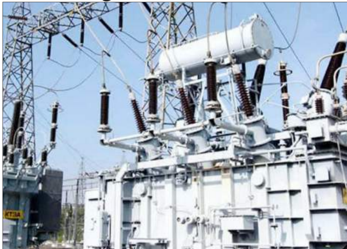
National Power Grid

closely. Data from the Nigerian Electricity Regulatory Commission shows that in 2025, generation companies issued invoices totalling about N3.16 trillion, while payments amounted to roughly N1.24 trillion, a settlement rate of just over 39 per cent. Of the N1.92 trillion shortfalls, the overwhelming majority was linked to unpaid subsidy obligations. In practical terms, only a small fraction