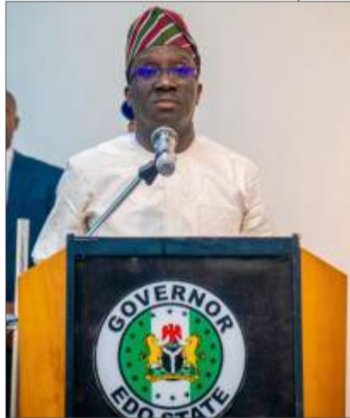
Governor Monday Okpebholo