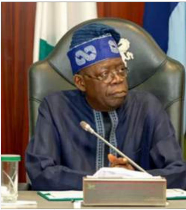
President Bola Tinubu

President Bola Ahmed Tinubu on Wednesday reaffirmed Nigeria's commitment to strengthening its economic and diplomatic relations with the United Kingdom, declaring that deeper cooperation, particularly in aviation, will drive growth, investment and shared prosperity.