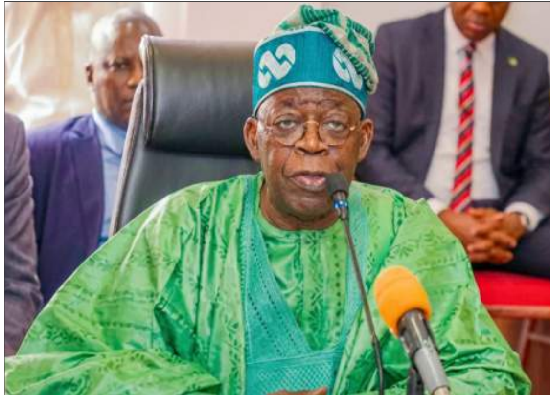
President Bola Tinubu

"Today, over 7.5 million Nigerian employees are covered under the Employees' Compensation Scheme, ensuring that when workplace accidents or disabilities