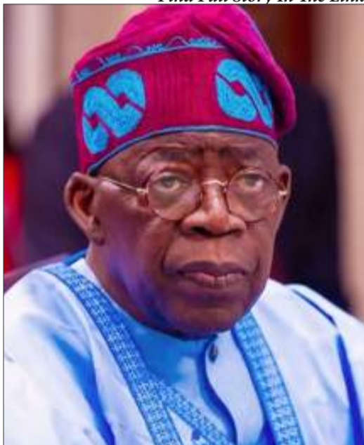
President Bola Tinubu