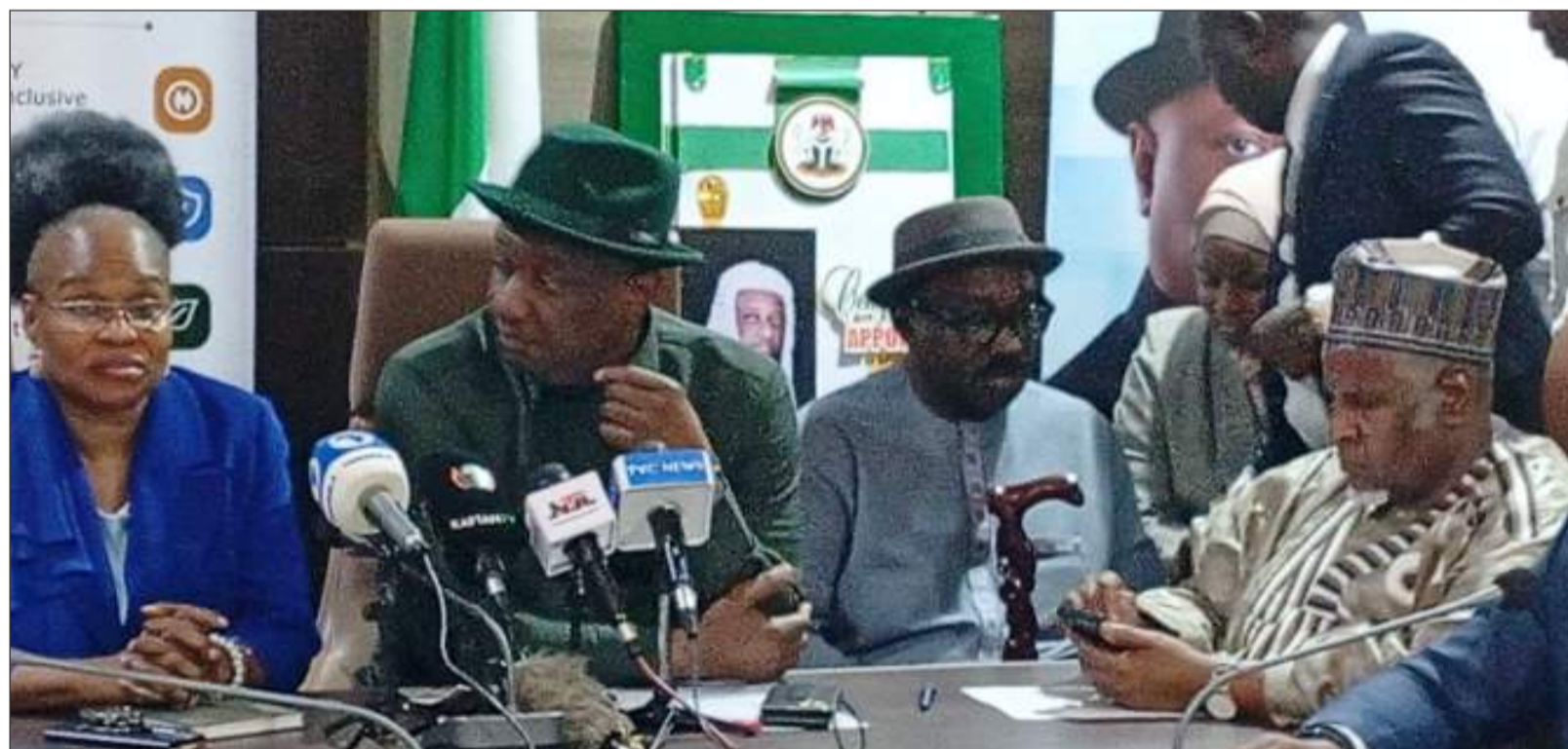
Keyamo schedules an emergency meeting with oil marketers, airlines regulators