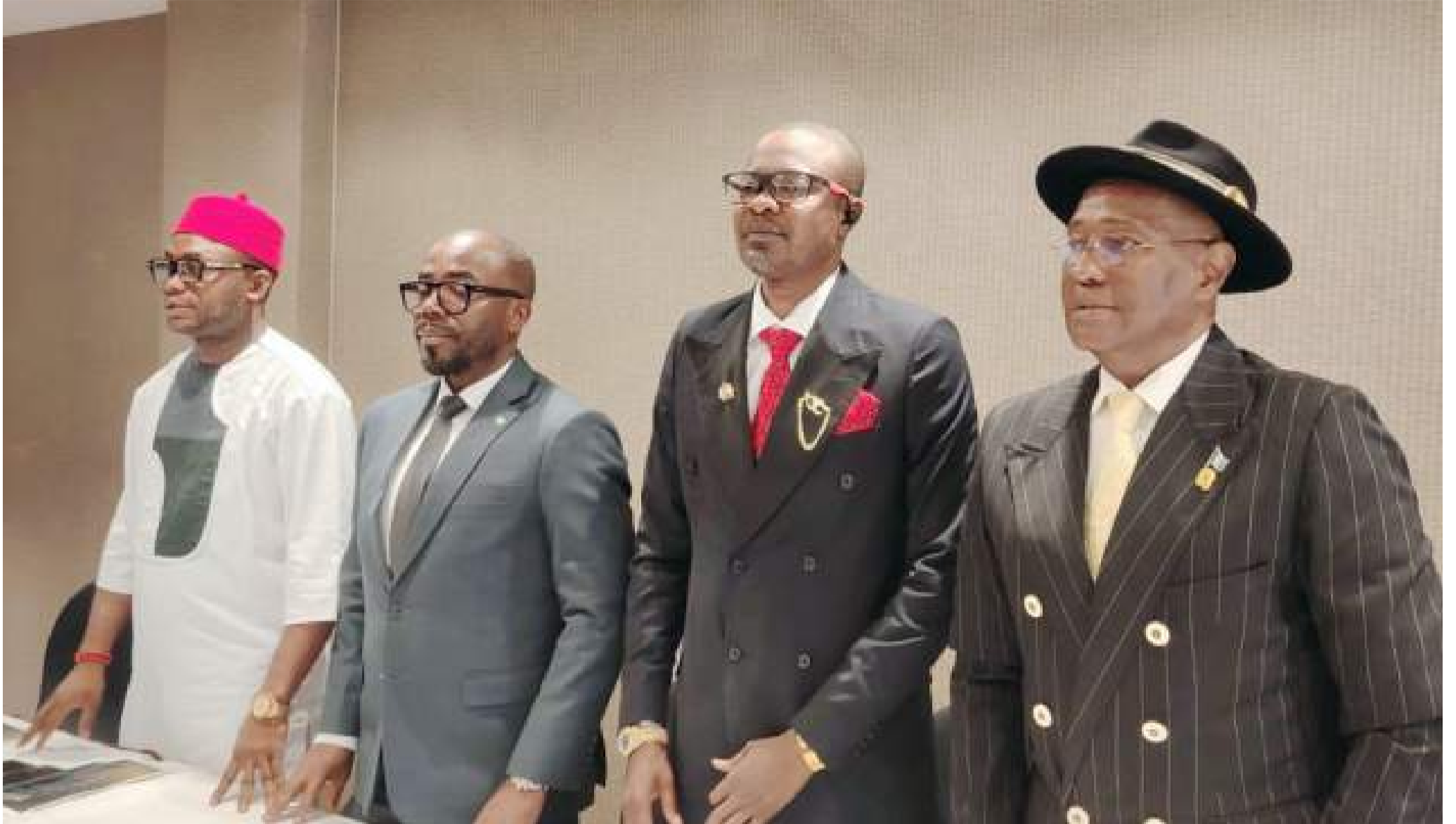
Nigeria eyes $500bn investment deal at Abuja 2026 investment summit