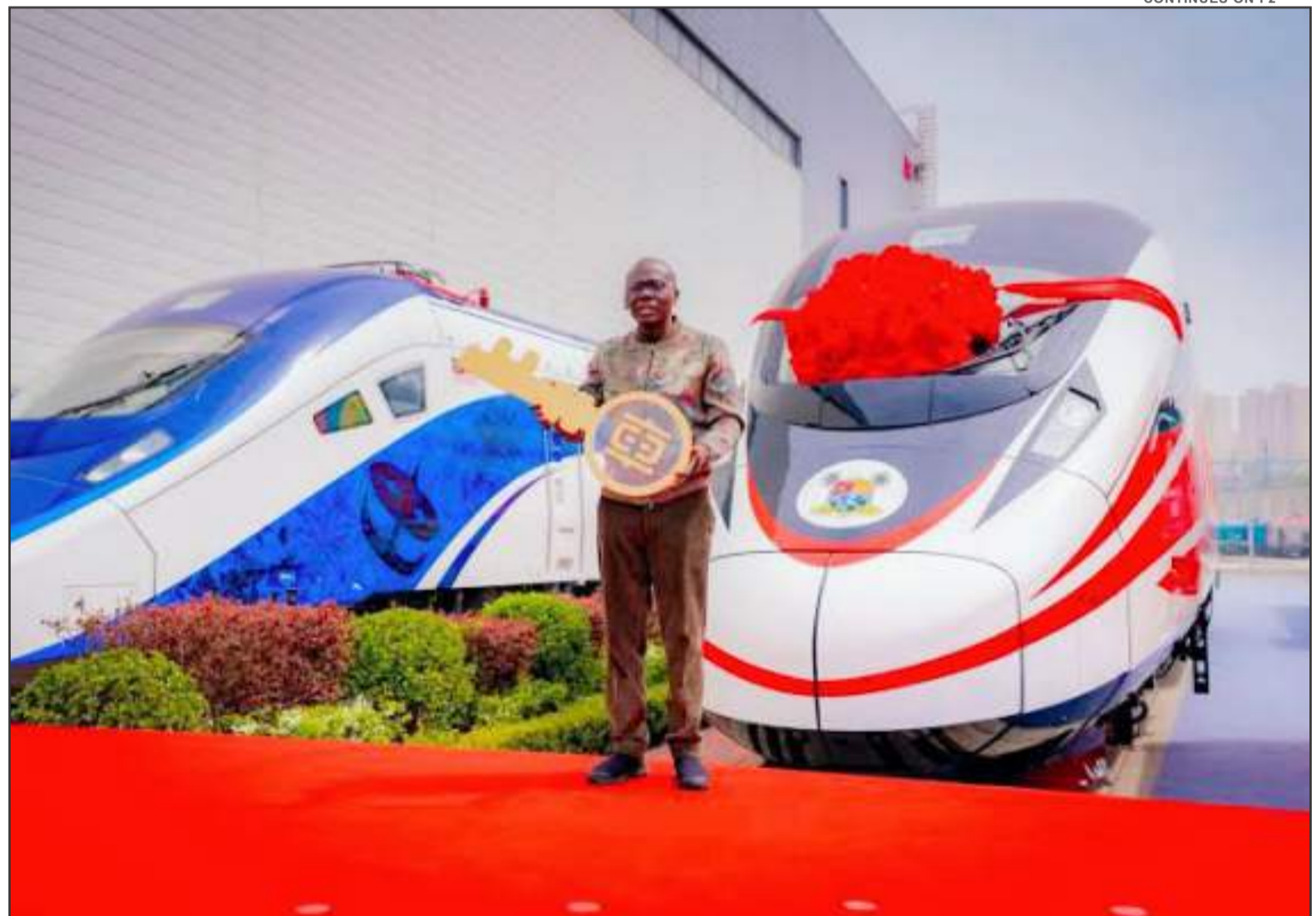
Governor Babajide Sanwo-Olu receiving the 24-car Trains to boost red line rail