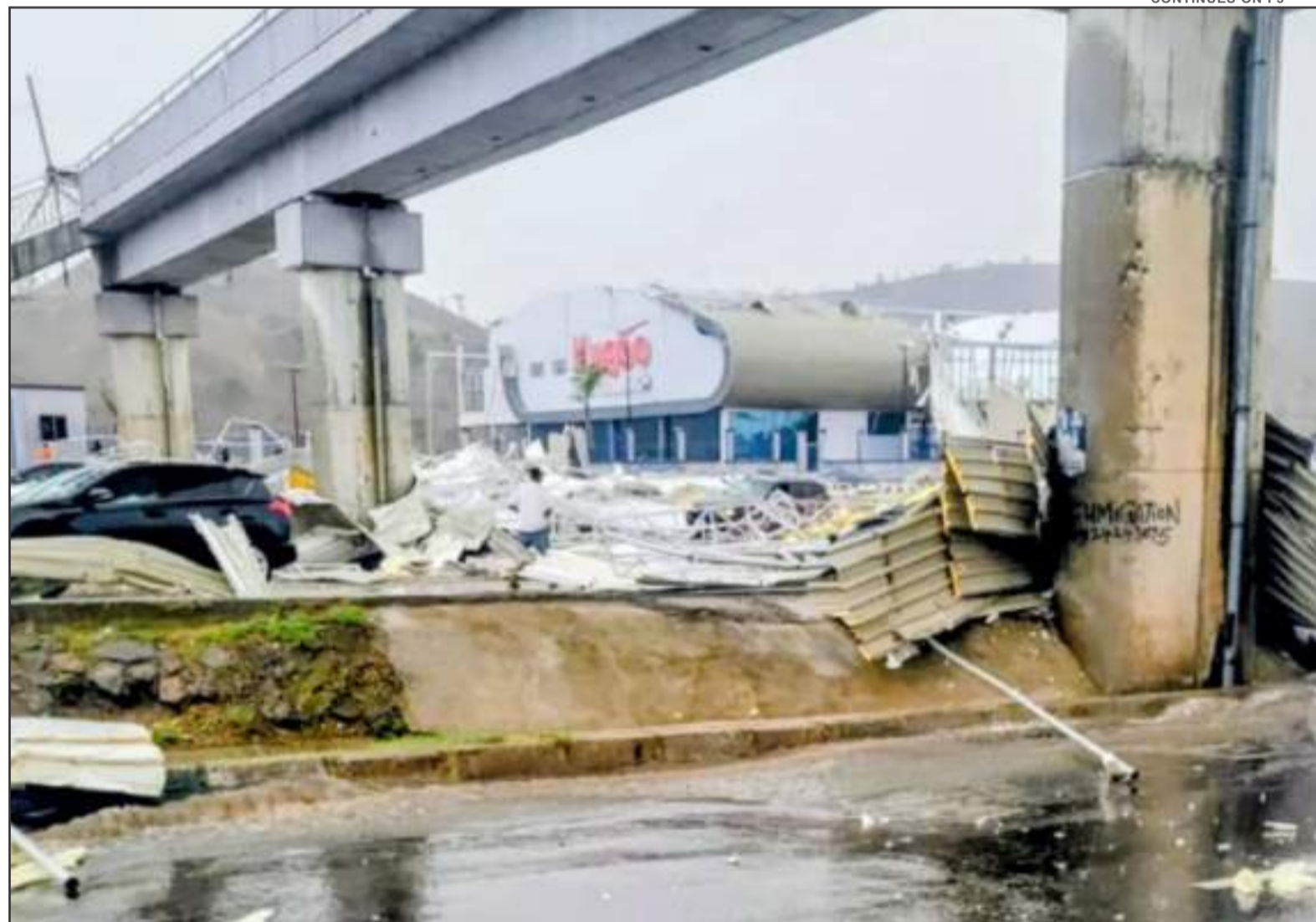
The Kugbo Bus and Taxi Terminal in Abuja