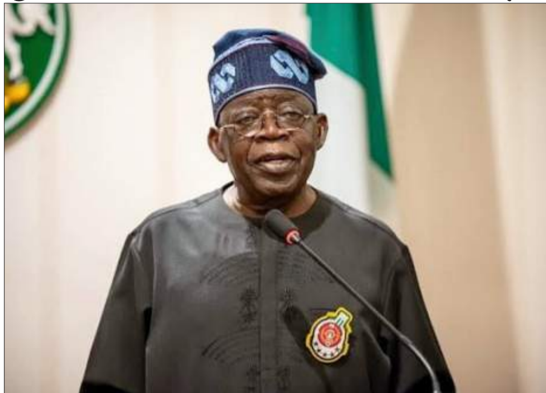
President Bola Tinubu