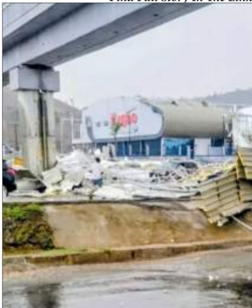
Lekki deep seaport