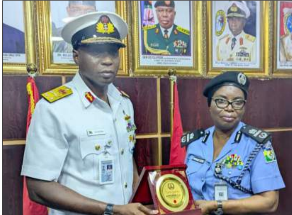
Maritime police renews commitment to the Western Naval Command