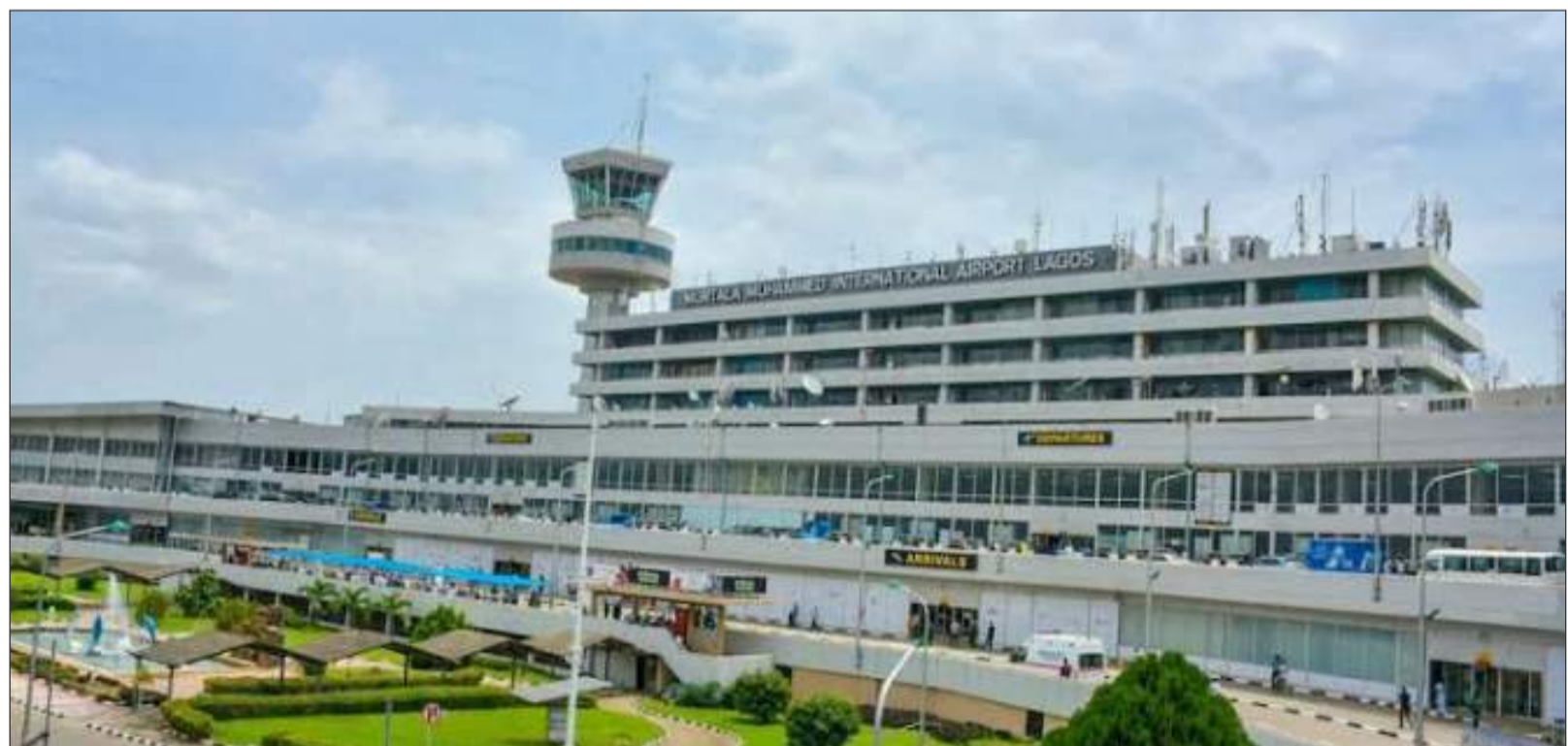
Murtala Mohammed Airport

The PUNCH gathered that the new tariff took effect on April 1, 2026, following a two-week notice issued by the terminal operators. The revised tariff sighted by our correspondent showed that sedan cars now pay N3,500 for the first hour, while Sports