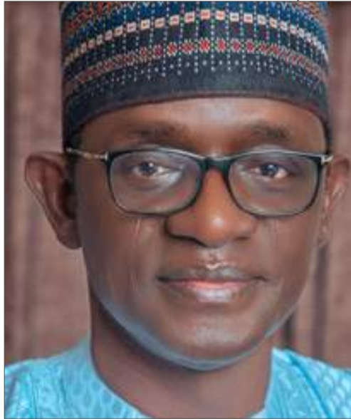
Governor Mai Buni