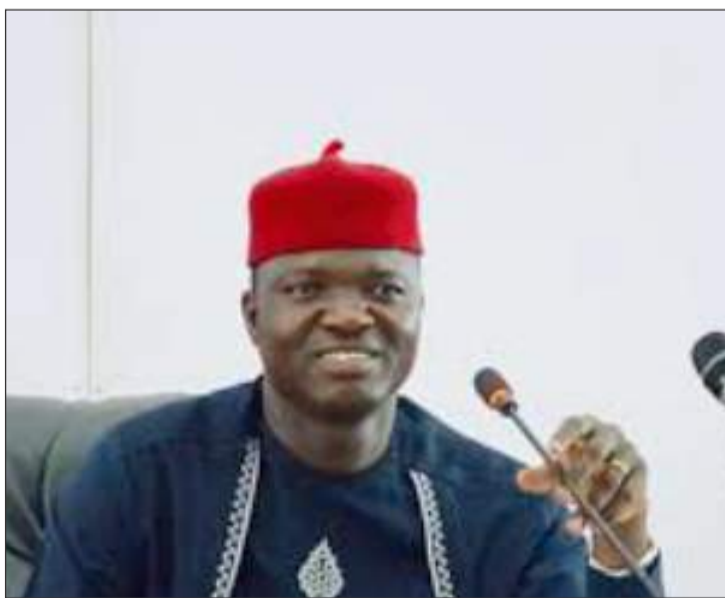
Governor Francis Nwifuru

Culled: Stakeholders and political leaders of Onicha Local Government Area of Ebonyi State have unanimously endorsed Governor Francis Nwifuru for a second term in office.