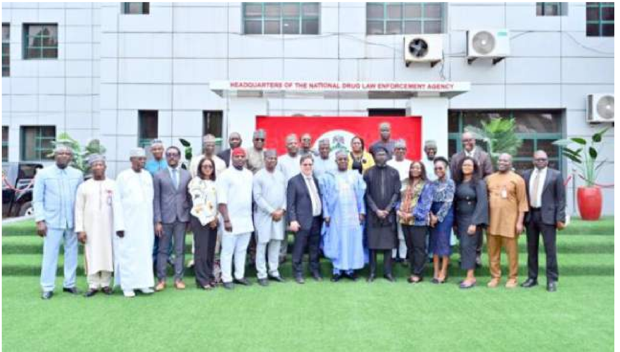
UNODC at the Nigeria Drug Law Enforcement Agency (NDLEA)