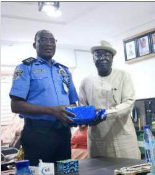
ATBOWATON strengthens alliance with the Police on Lagos-Ogun W'ways

The Association of Tourist Boat Operators and Water Transporters of Nigeria has stepped up efforts to enhance security across Nigeria's coastal waterways, forging stronger collaboration with the Nigeria Police Force in Lagos State and Ogun State.