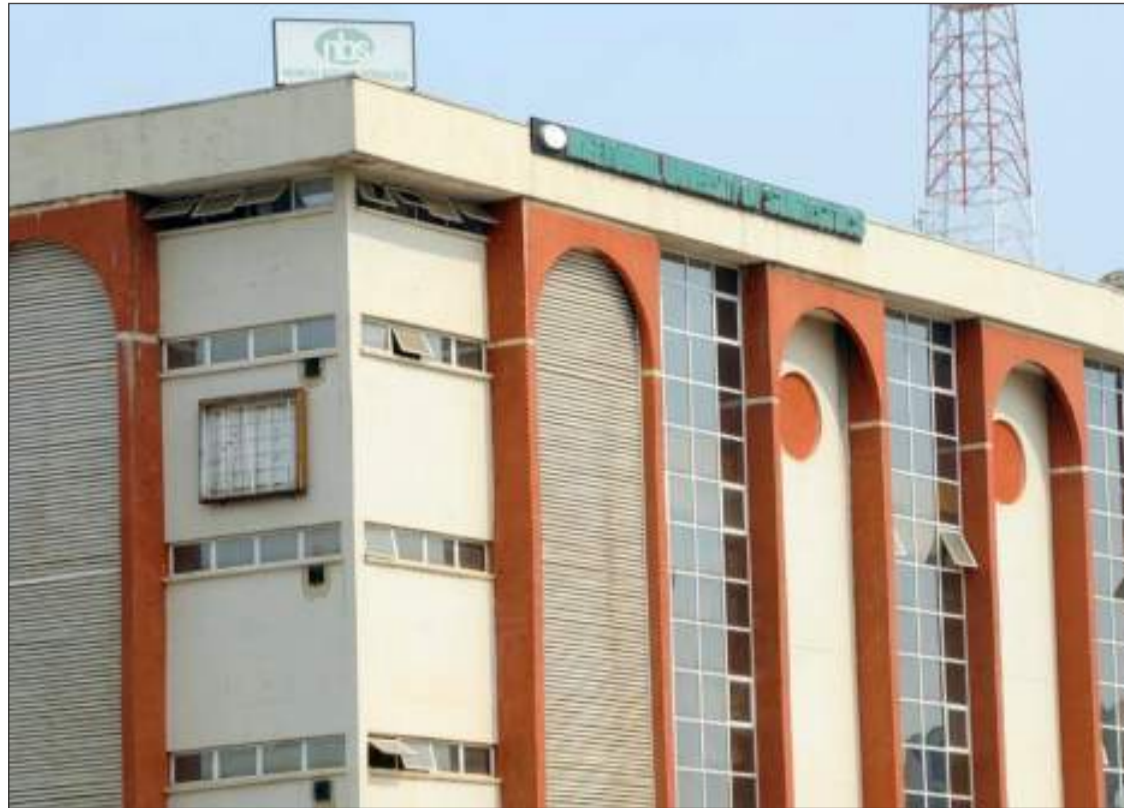
National Bureau of Statistics (NBS)

Among the subnationals, Lagos state recorded the highest domestic debt in Q4 2025 with N1.22 trillion, followed by Rivers with N378.81 billion, while