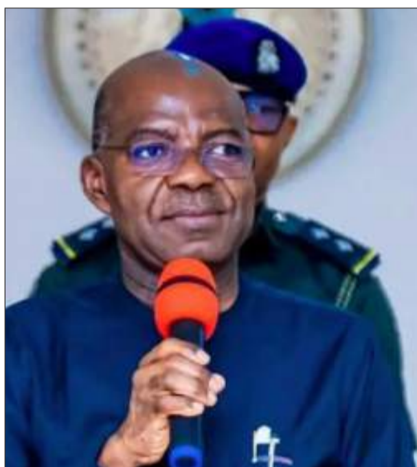
Governor Alex Otti

The Abia State Government has reaffirmed its commitment to modern transportation, urban renewal and housing development, with a proposed railway project in Umuahia forming a key part of its infrastructure drive.