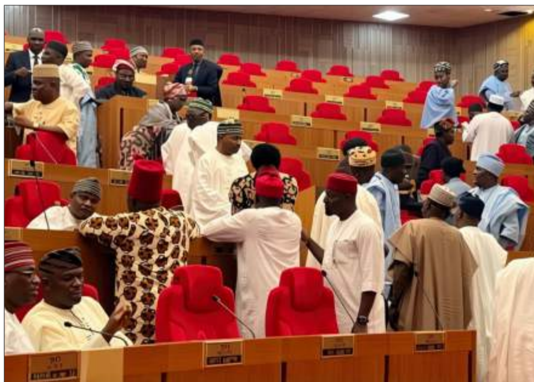
House of Representatives

"We came here to resolve some of the issues within the maritime sector, which has to do with the increase in tariffs. There is a need for a slight adjustment, and the regulator is working with all