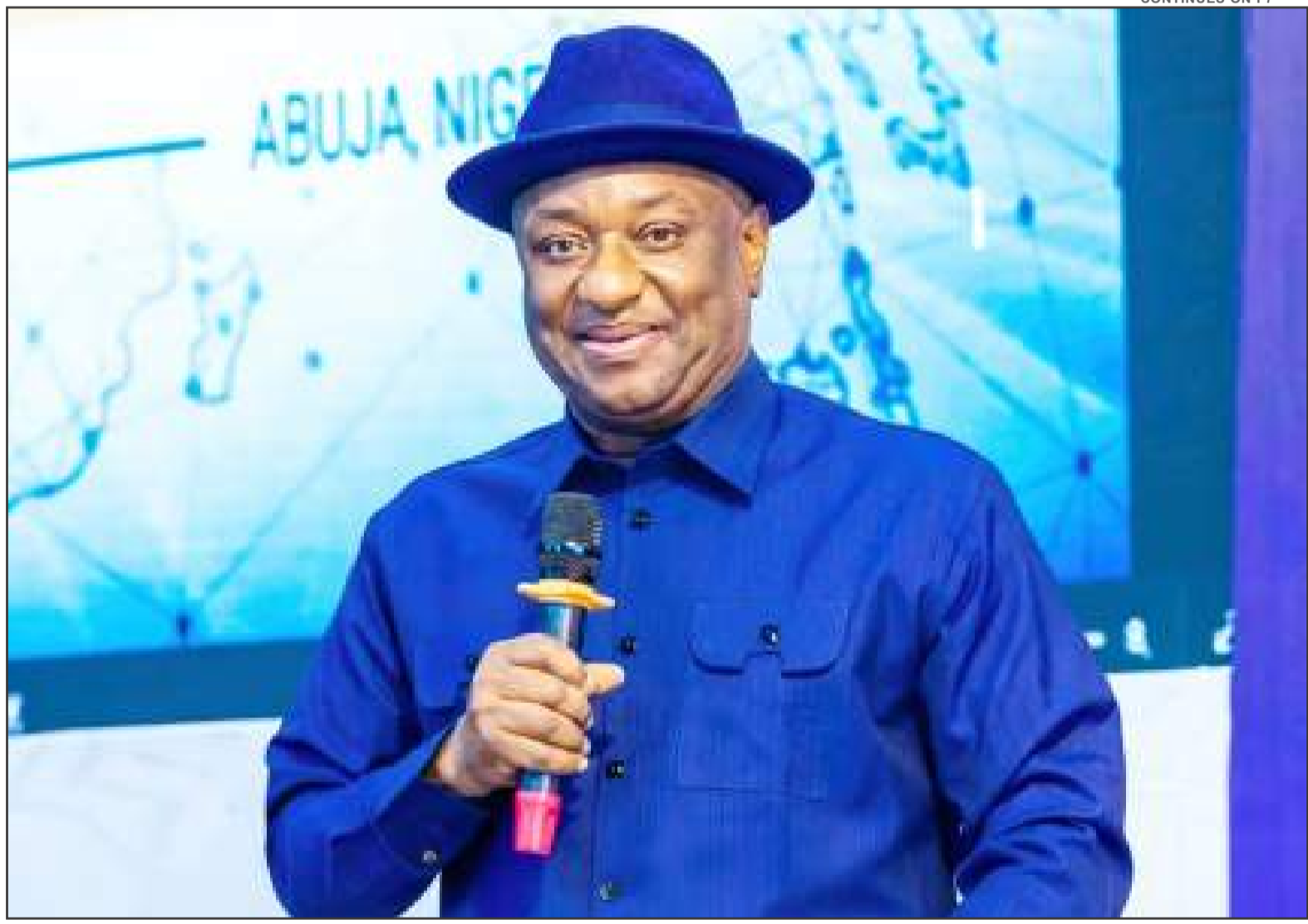
Festus Keyamo, SAN - Minister of Aviation and Aerospace Development

Otti Plans Abia Railway, Ramps Up Other Projects P7