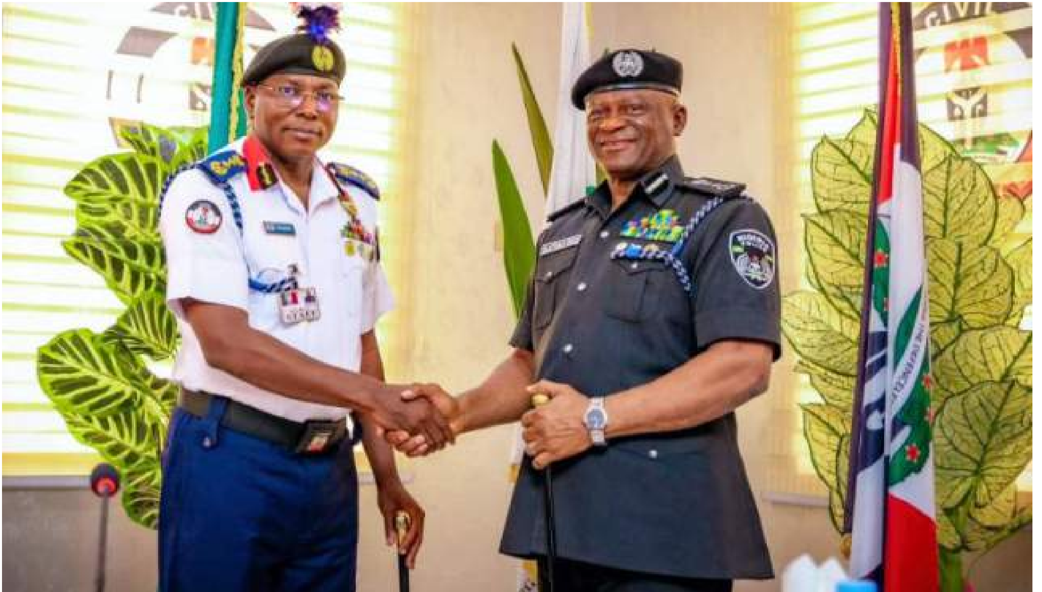
Nigeria Police, Civil Defence strengthen security collaboration