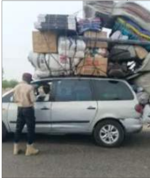
FRSC intercepts an overloaded vehicle