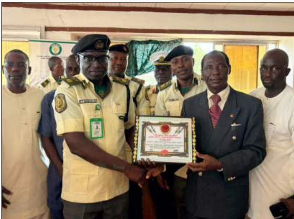
The TRACE officials receiving the award