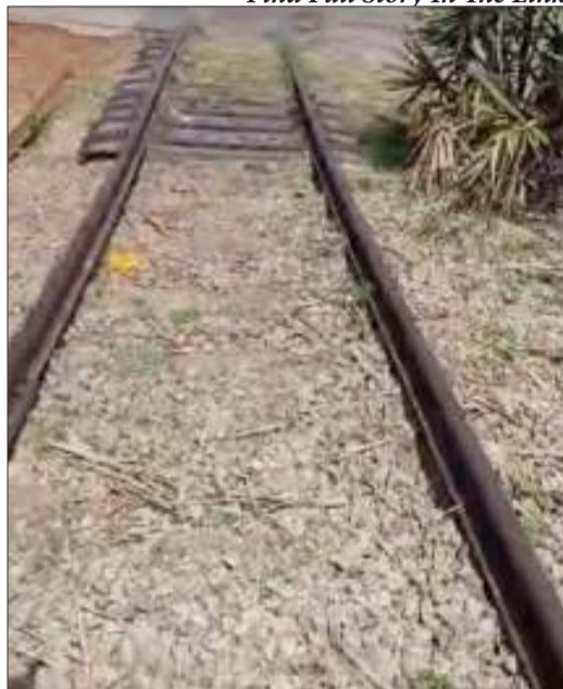
Damaged railway tracks