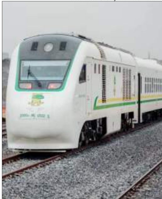
Nigerian Railway Corporation (NRC)