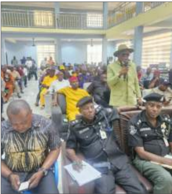
Police partner NURTW in Delta Transport Sector

Delta State Commissioner of Police, Yemi Oyeniyi, on Monday held a strategic meeting with leaders of the National Union of Road Transport Workers and other transport stakeholders across the state as part of ongoing efforts to strengthen security collaboration and enhance crime prevention.