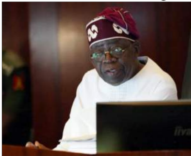
President Bola Tinubu

Culled: The diplomatic community in the country has thrown its weight behind President Bola Ahmed Tinubu's "Renewed Hope Agenda," describing it as a strategic blueprint for tackling Nigeria's economic and