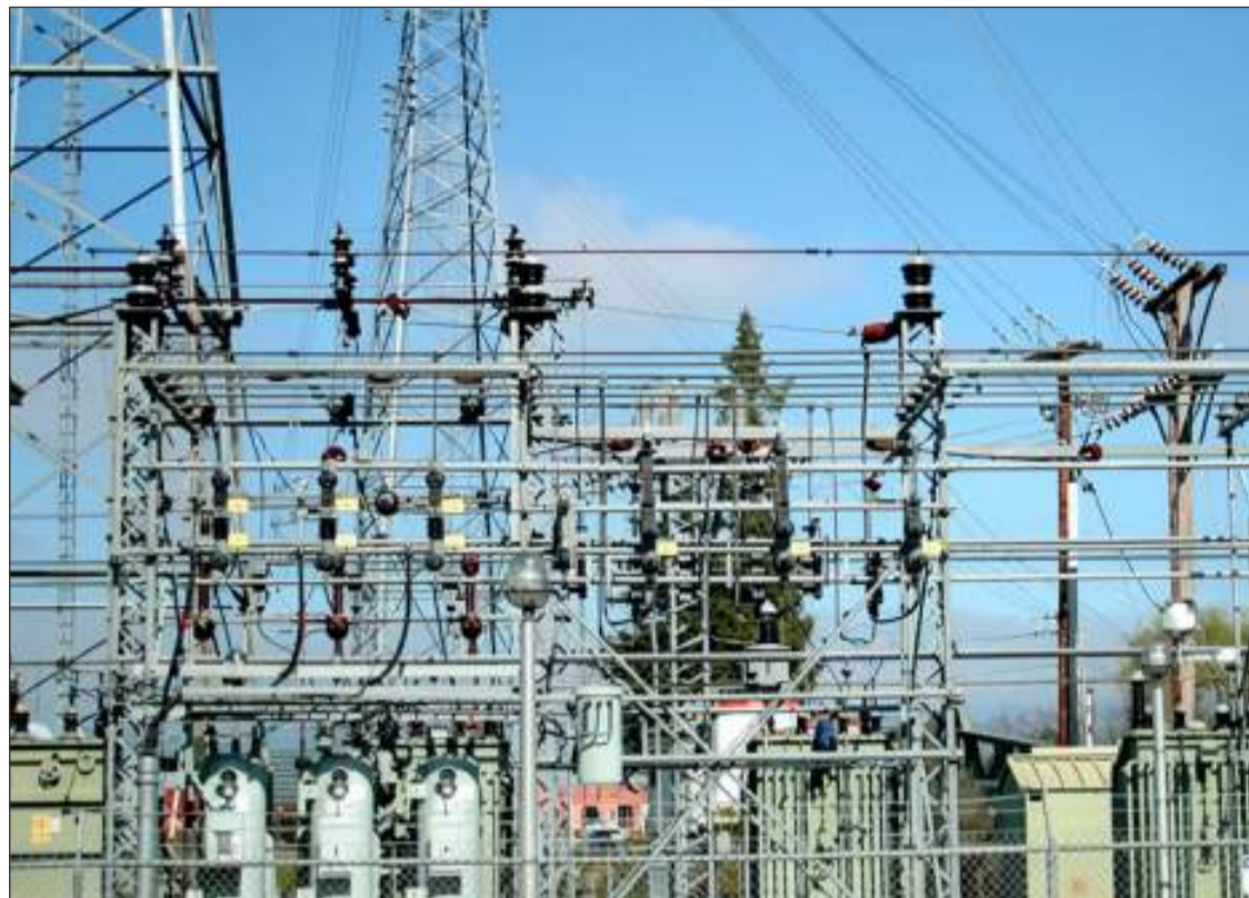
Nigeria Electricity grid

She described NDPHC as a strategic institution within the power sector because of its broad mandate covering electricity generation, transmission, and