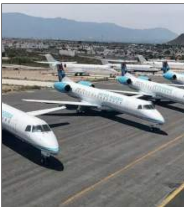
United Nigerian Airlines

Nigerian airlines are reviewing their business and operational strategies in response to rising aviation fuel costs and persistent economic pressures threatening the sustainability of flight operations across the country.