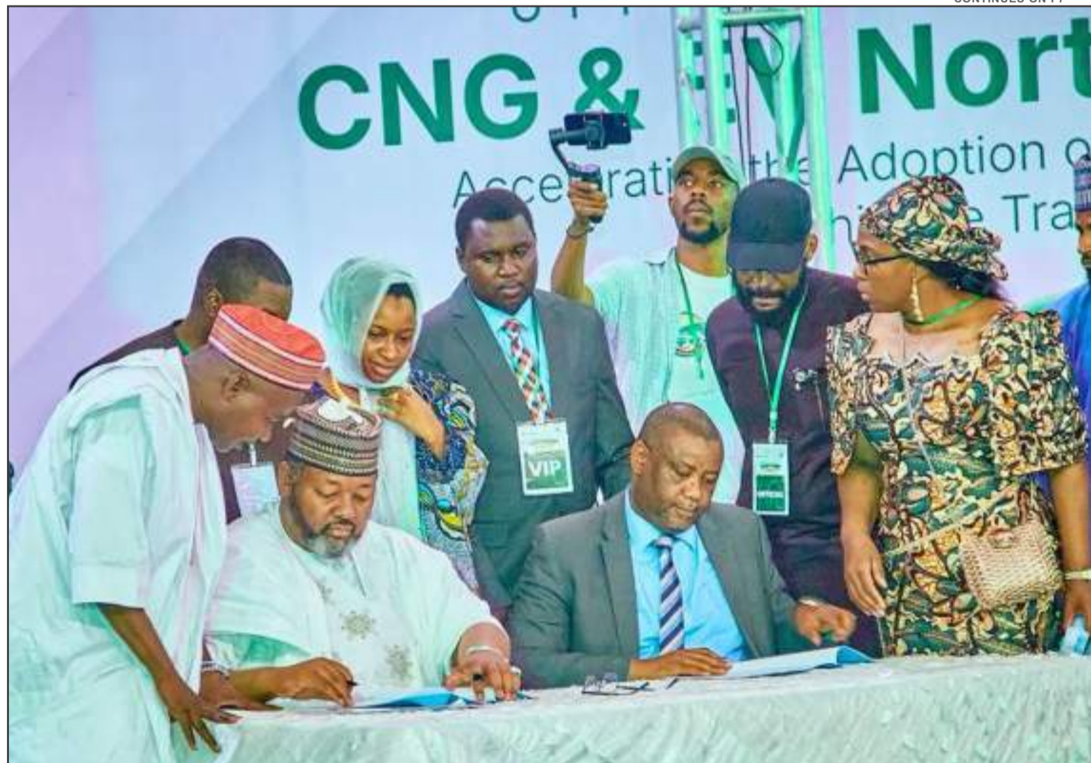
The signing of the PCNG initiative partnership agreement in Kano State