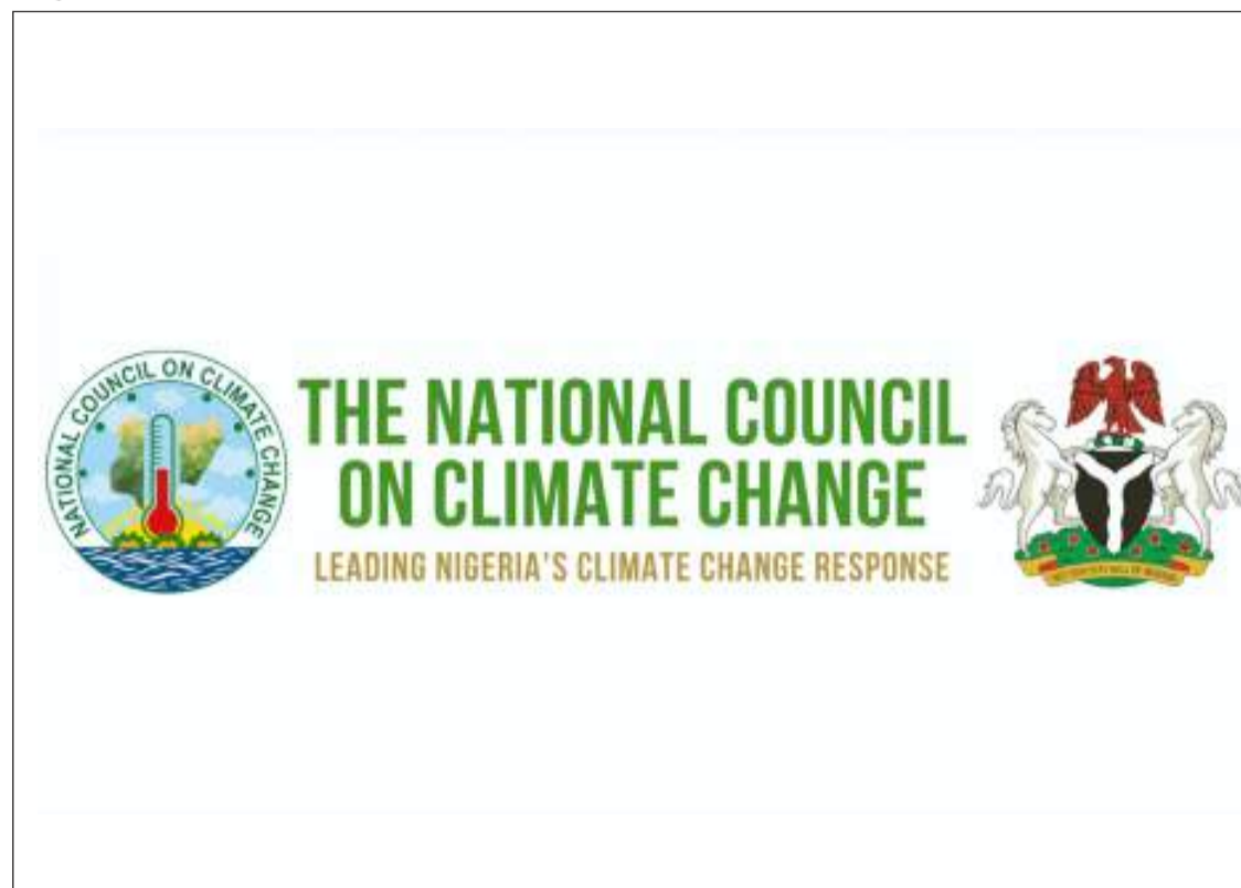
National Council on Climate Change (NCC)

climate policy is flying blind. "This groundbreaking national survey marks a major step toward inclusive, evidence-based climate governance in Nigeria by generating critical insights into how climate change affects women and men differently across diverse climatic zones," she said.