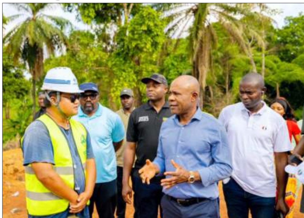
Governor Mbah inspects major road project

He described the 40-kilometre dual carriageway as a strategic gateway that would improve connectivity between Enugu and the North Central region.