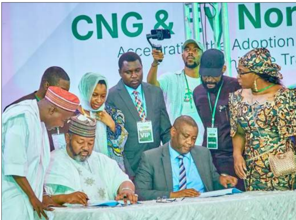
LOTUS partner FG on CNG, EV initiative plan

Represented by the Deputy Chief of Staff