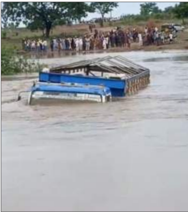
Heavy flooding on the collapsed Moro Bridge

Commuters travelling along the Ilorin-Igbeti Federal Highway in Kwara State were left stranded on Monday after heavy flooding overtook the collapsed Moro Bridge, submerging vehicles and disrupting movement across the busy interstate route.