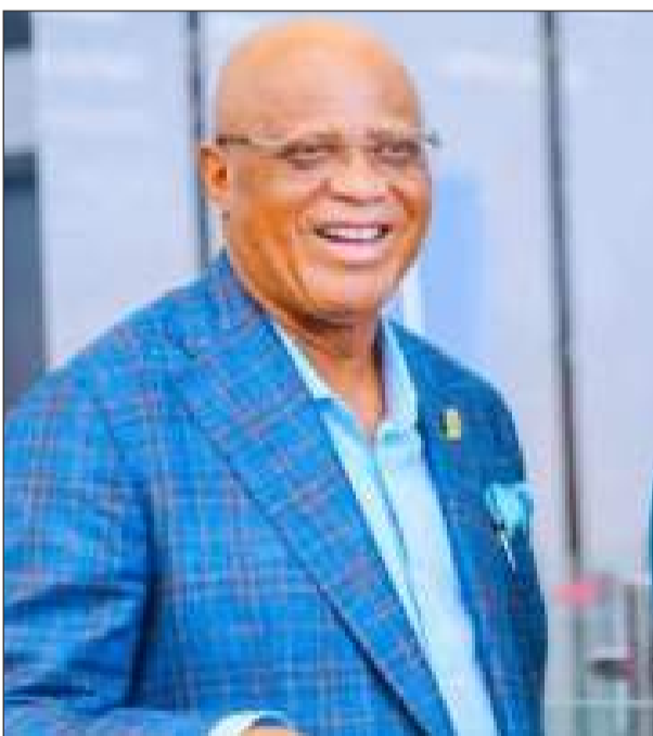
Governor Umo Eno

The Minister of Aviation and Aerospace Development, Festus Keyamo, SAN, has highlighted the strategic significance of the Victor Attah International Airport in Akwa Ibom State, describing it as a transit hub remarkably unique in the country.