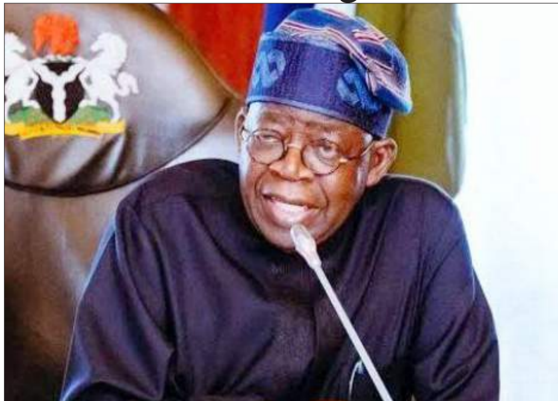
President Bola Tinubu