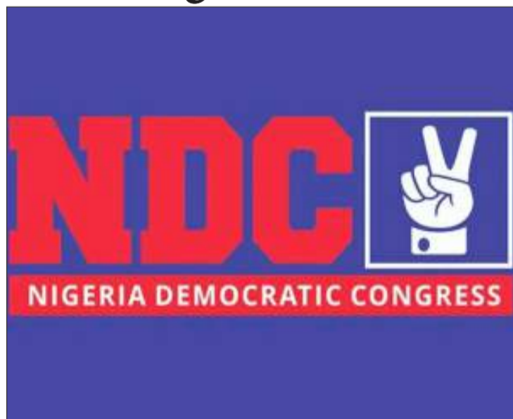
Nigeria Democratic Congress (NDC)