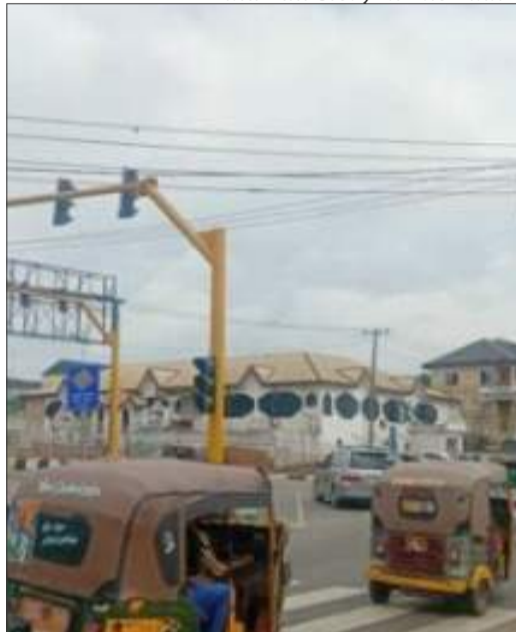
The traffic lights