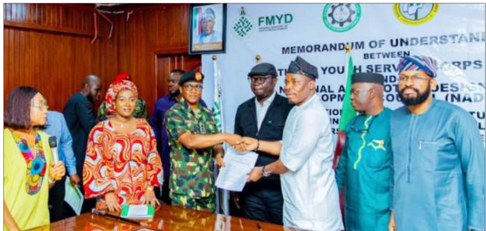
NADDC drives CNG skills programme to NYSC members