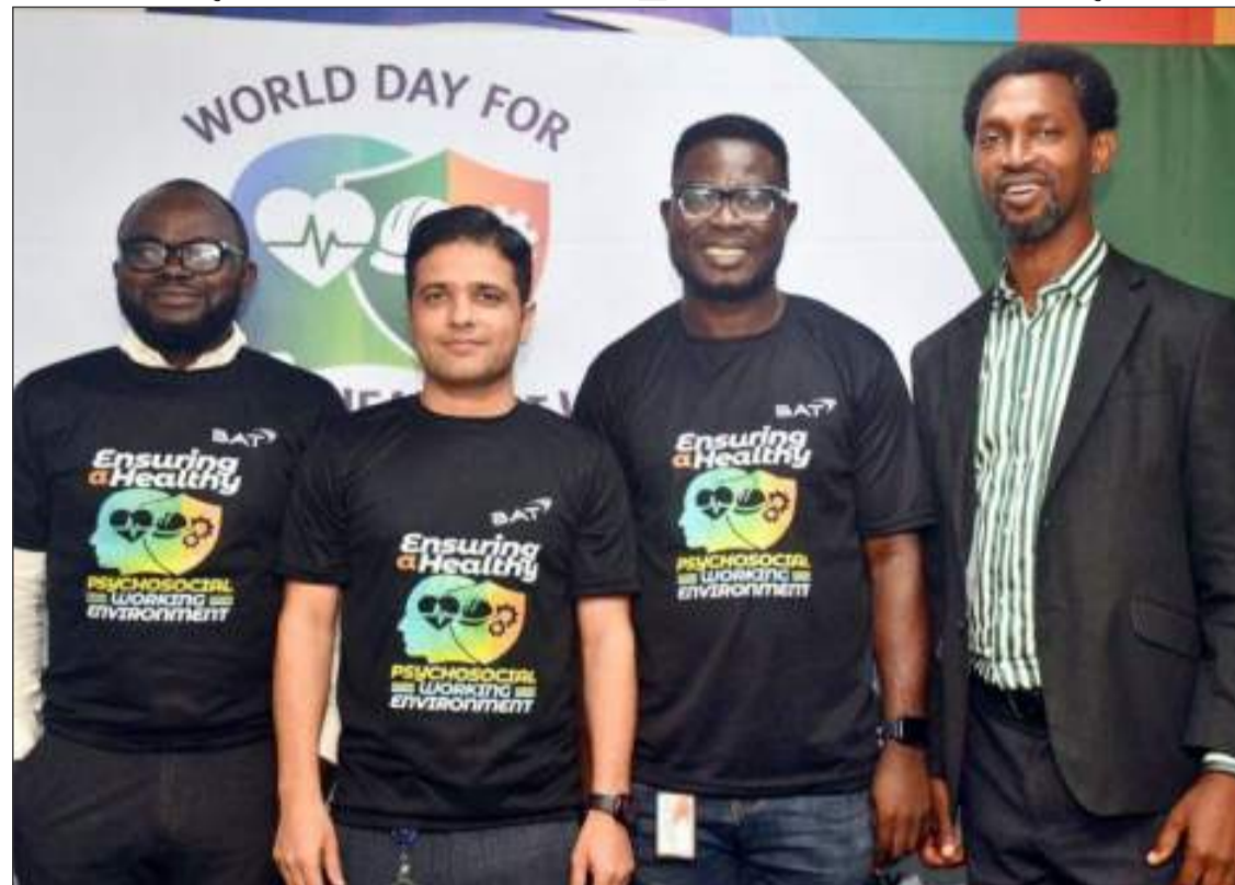
Medbury, BAT push for psychosocial well-being for workplace safety