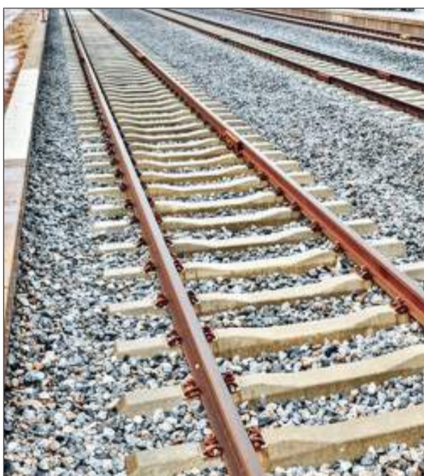
Nigerian Railway Corporation (NRC)

The Nigerian Railway Corporation (NRC) said cargo movement via rail at the Lagos seaports increased to 176,820 tonnes with a total of 198 freight trips in the first quarter (Q1).