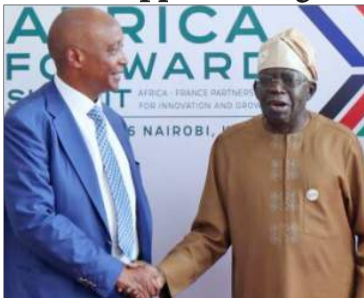
Tinubu approves Nigeria's hosting of 2026 CAF Awards