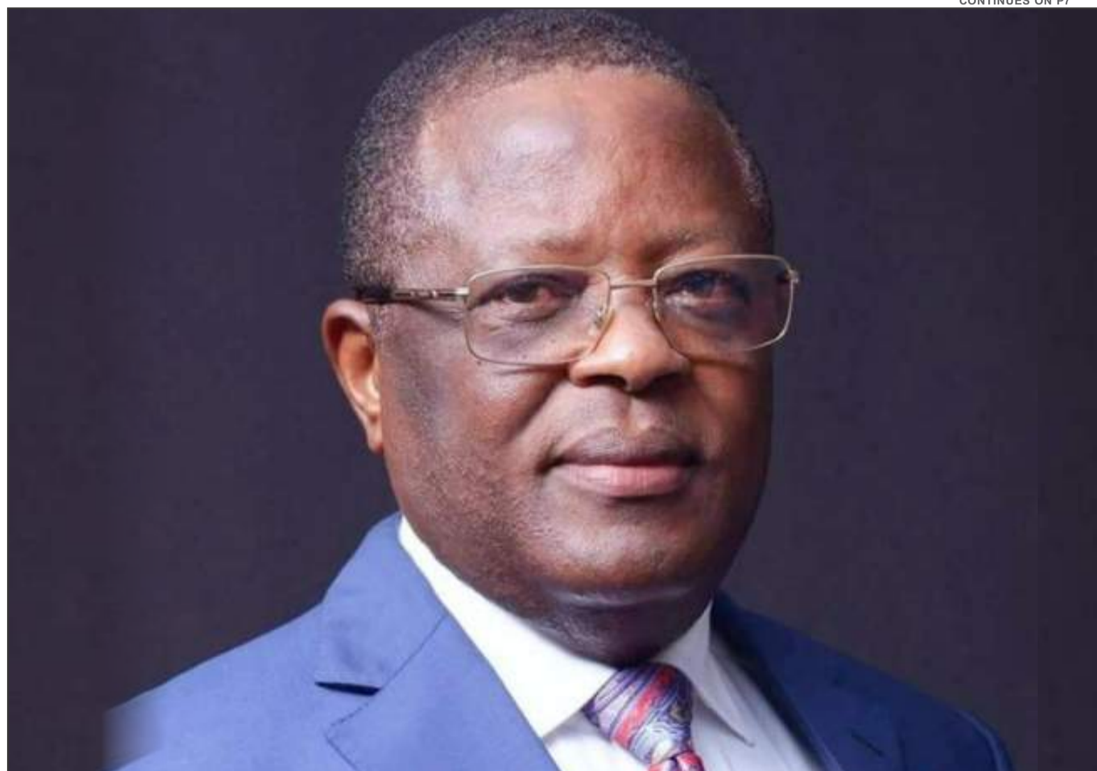
Senator David Umahi - Minister of Works