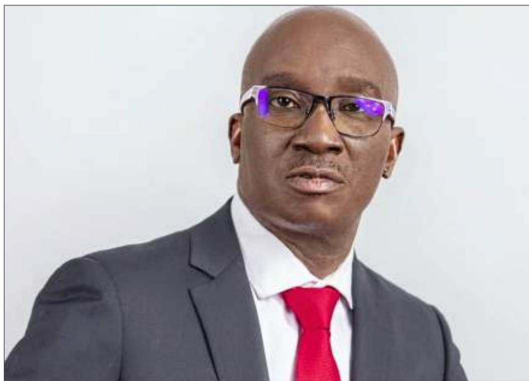
Governor Monday Okpebholo

"I don't want to unveil the distribution pattern yet, but we are going to distribute them across the three senatorial districts to ease transportation and minimise the stress