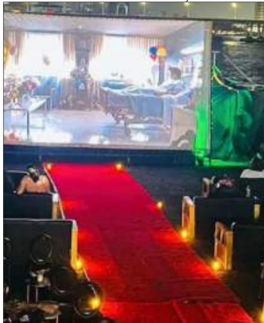
The water side cinema movie by LAGFERRY