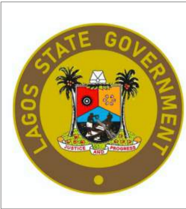
Lagos State Government (LASG)

The Lagos State Government has announced plans to strengthen the management of Central Business Districts (CBDs) across the state through new legal reforms, improved infrastructure, enhanced security systems and stricter environmental enforcement.