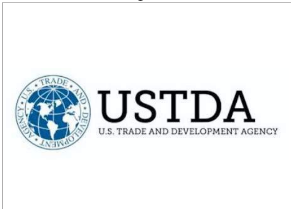
U.S Trade and Development Agency (USTDA)

He said, "USTDA is bringing private sector solutions to unlock widespread, affordable, trusted internet access in off-grid