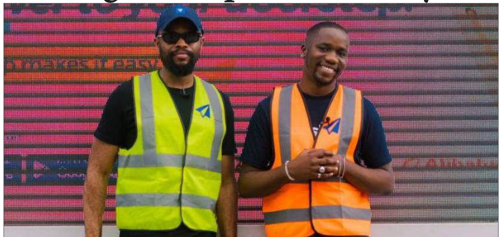
African shipping outlook 2025

The study also highlighted the rapid expansion of social commerce across Africa, which grew by 51 per cent