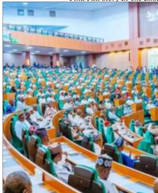
The reps green chamber