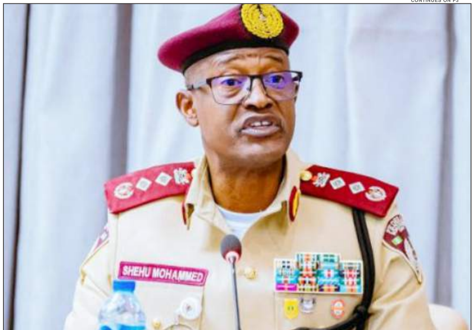
Shehu Mohammed - Corps Marshal of the Federal Road Safety Corps (FRSC)