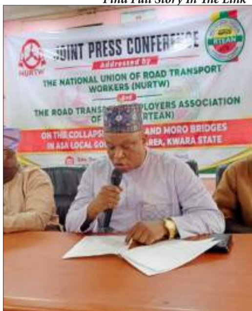
Kwara NURTW unit