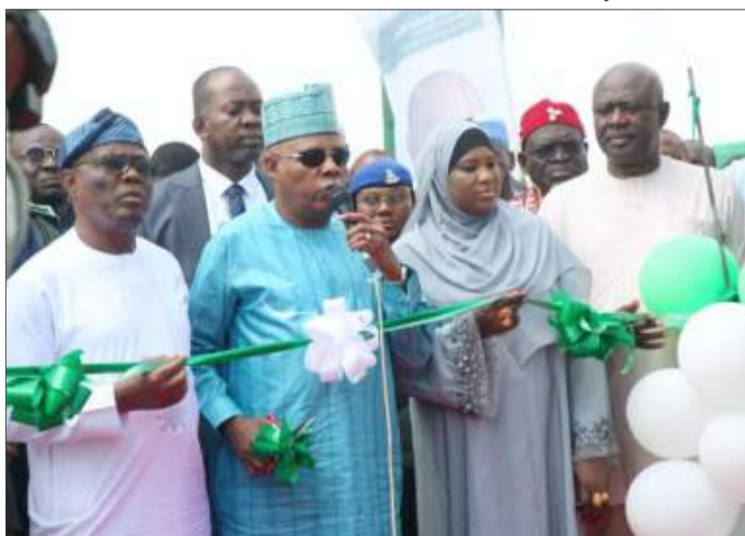
Shettima commissioning the Kuje road on behalf of Tinubu

According to the President, the road had become a source of hardship for residents and businesses due to prolonged construction delays, resulting in traffic congestion, dust pollution during the dry season and muddy conditions during the rainy season.