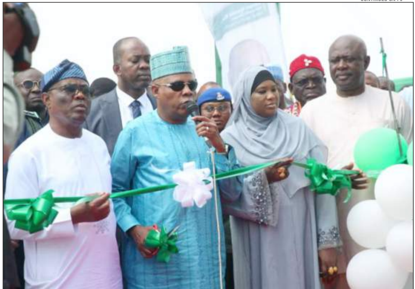
Kashim Shettima inaugurating the Kuje Road on behalf of President Tinubu

NIMASA Boosts Maritime Security With 177 Deep Blue Operatives P5 Shareholders Back NAHCO Bid For Airport Terminal Concessions P5 Ground Handlers Suspend Max Air Operations Over Ibn Debt P7