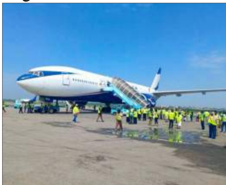
Nigerians evacuated from SAfrica arrive in Lagos