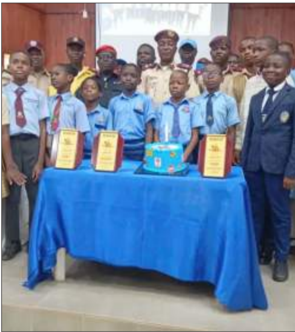
FRSC promotes road safety through students' quiz

The Federal Road Safety Corps (FRSC), Ikorodu Unit Command, has intensified efforts to promote road safety awareness among young Nigerians through a Road Safety Club Quiz Competition organised to mark the 2026 Children's Day celebration.