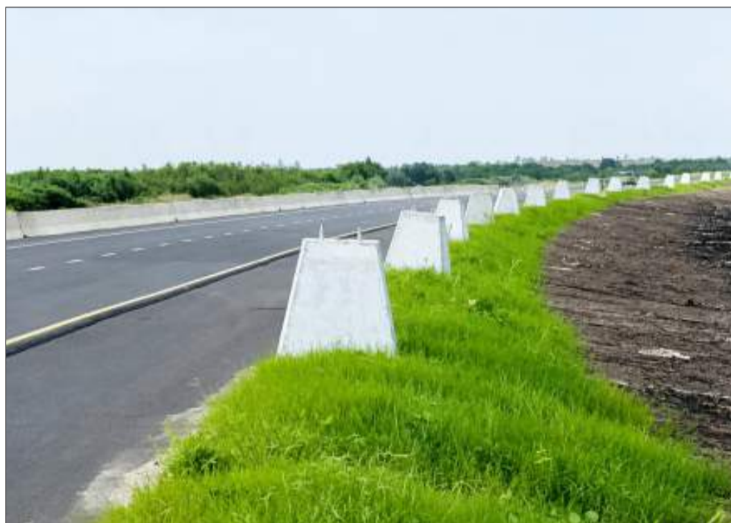
Bodo-Bonny road project

According to Nippert, the project was delivered within the approved budget, generating savings that are now being