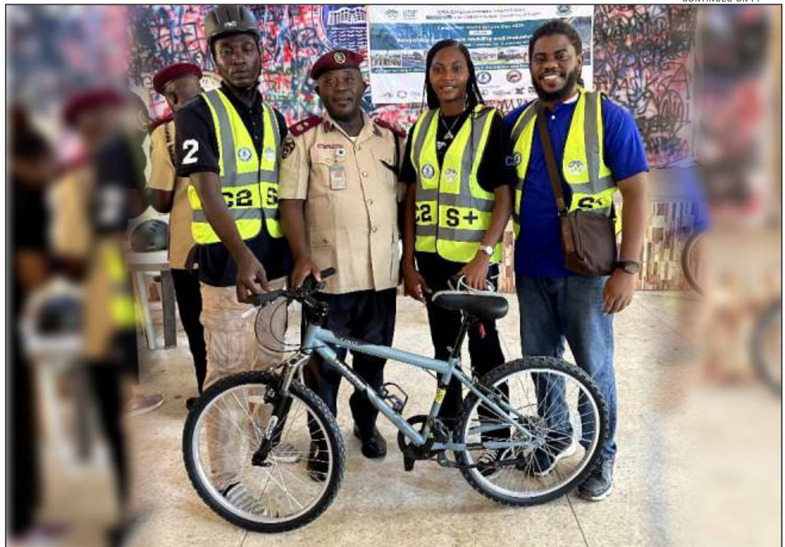
The GRA Foundation celebrates the World Bicycle Day by donating free bicycles to ISL students