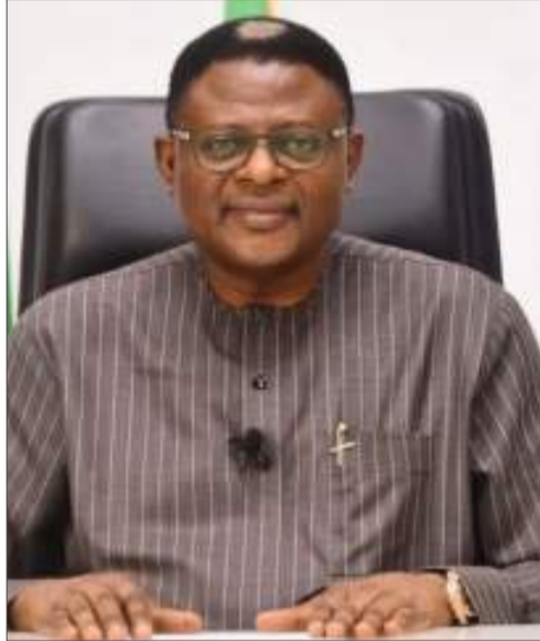
Governor Bassey Otu