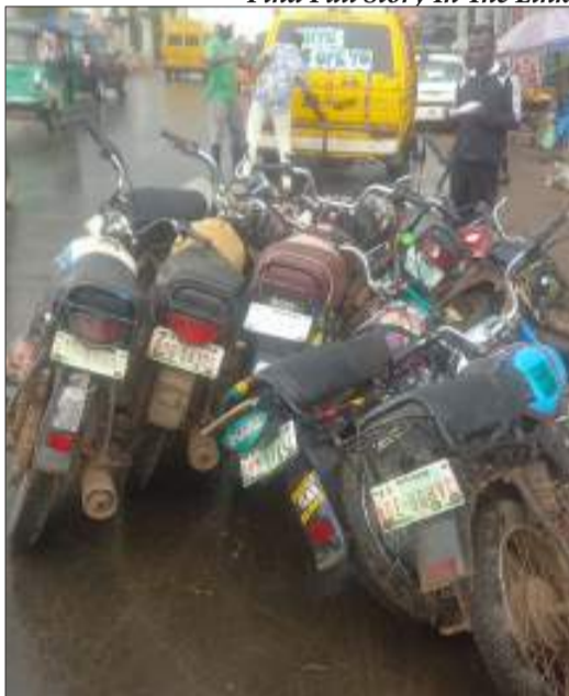
Impounded motorcycles by the Lagos Taskforce