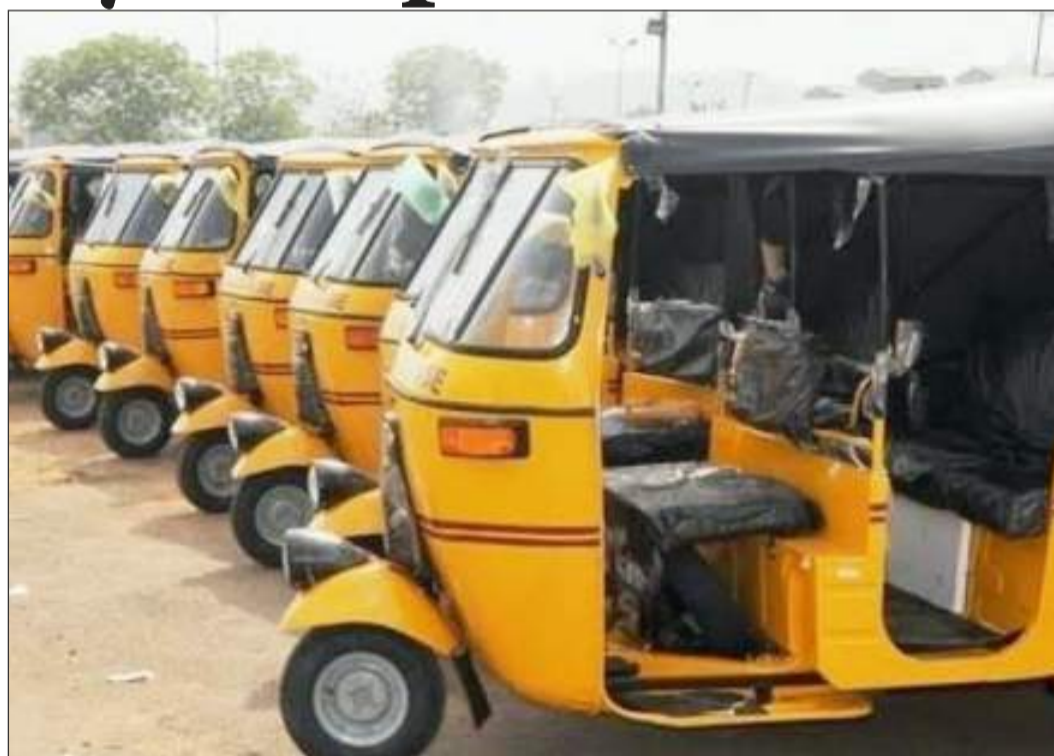
Keke riders transport

He noted that the exercise would later be expanded to include other categories of commercial transport operators such as motorcycle riders, bus drivers and other stakeholders in