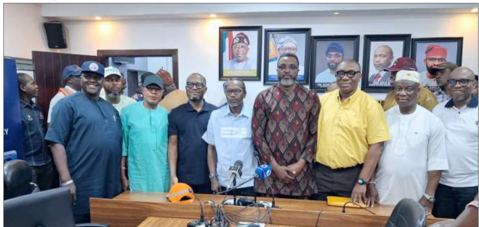
Lagos declares zero tolerance for roadside waste dumping