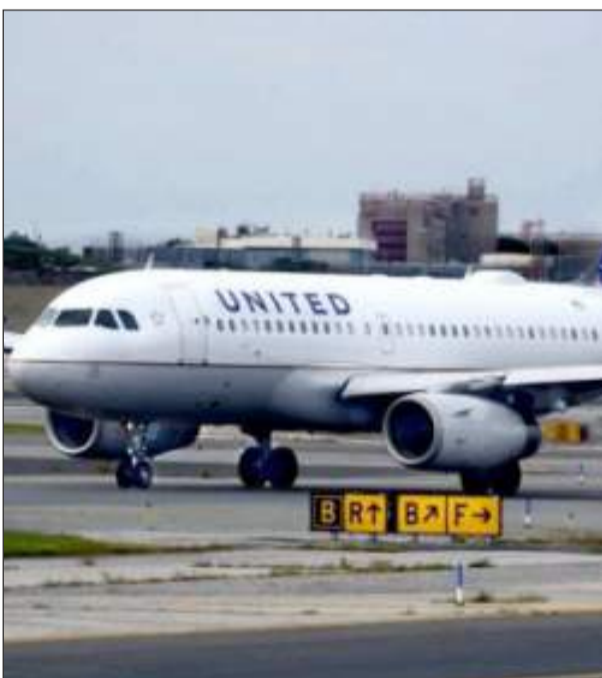
United Nigeria airlines

Nigeria imported crude oil worth $1.39bn in the first quarter of 2026, highlighting a major shift in the country's petroleum trade dynamics as the Dangote Petroleum Refinery increasingly sourced feedstock from international markets despite Nigeria's status as Africa's largest crude oil producer.