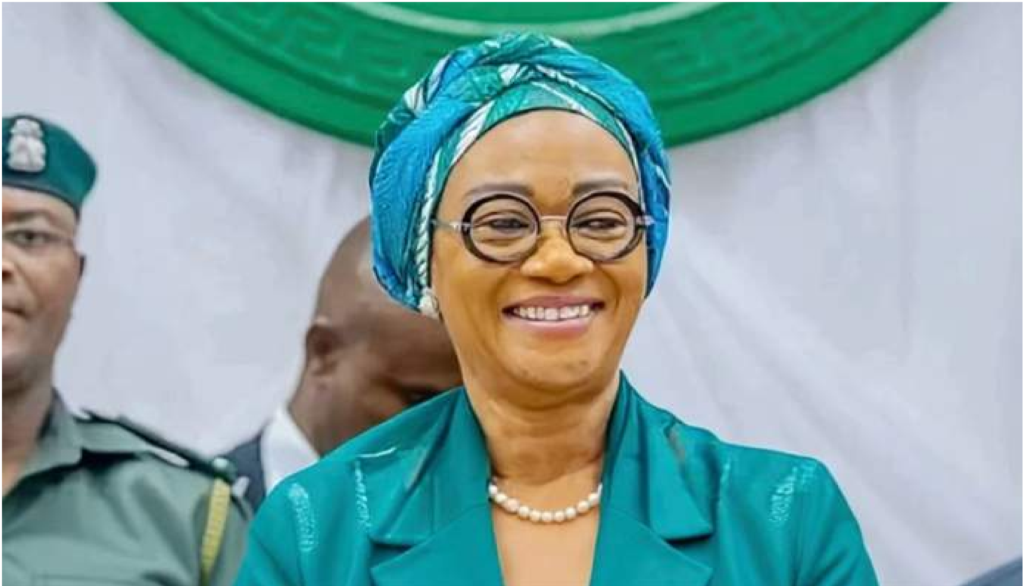
Senator Remi Tinubu