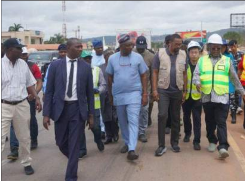
Umahi inspecting the Maraba-Keffi highway

Expressing satisfaction with the contractor's performance, the minister