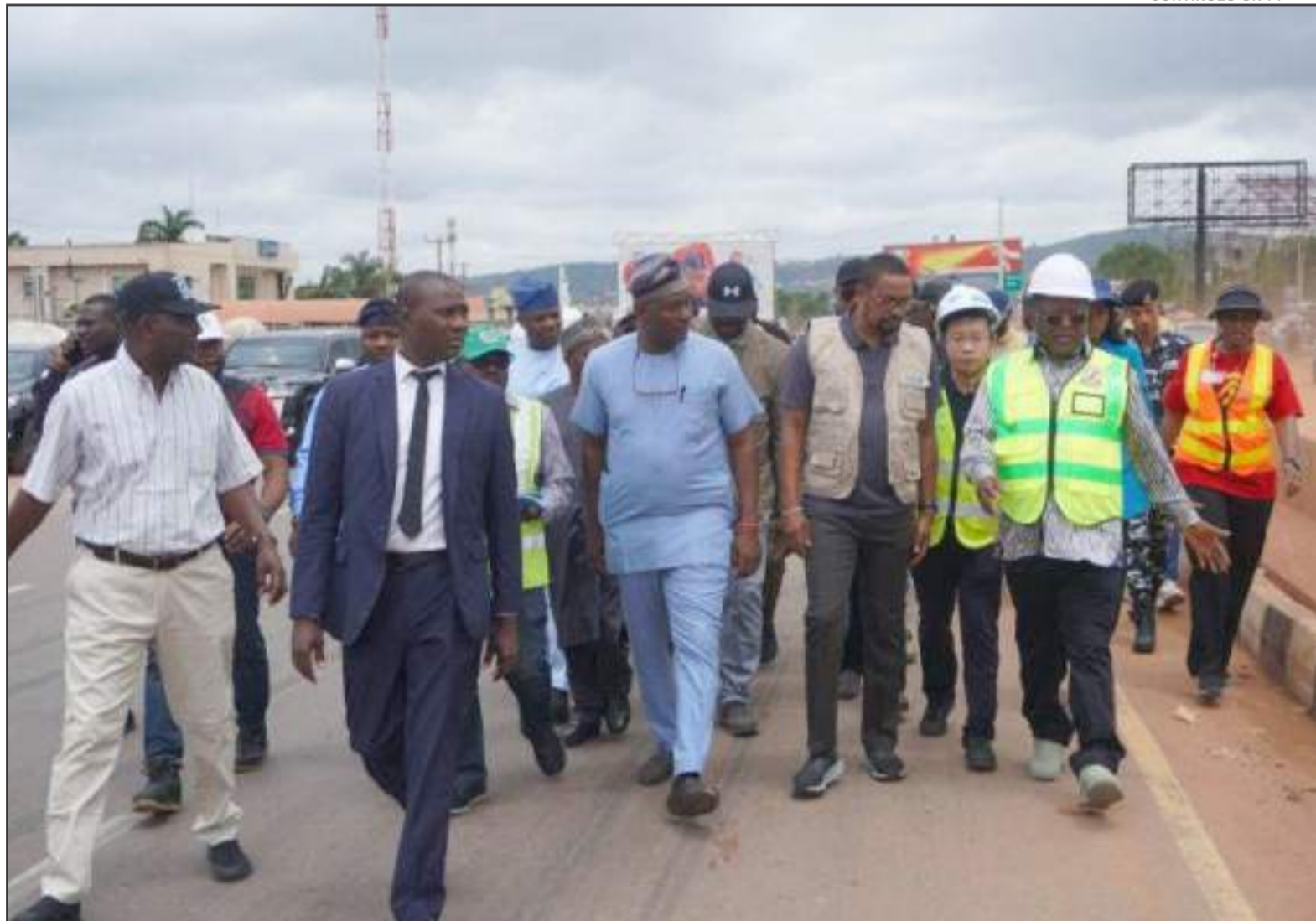
Senator Umahi inspecting the Maraba-Keffi highway road