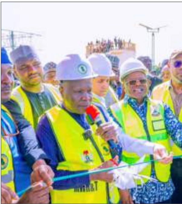
Governor Yahaya inaugurates Gombe-Biu highway alongside Umahi

The Federal Government has officially flagged off the reconstruction and dualisation of the 125-kilometre Gombe-Biu Highway, a major infrastructure project valued at N1.245 trillion, as part of efforts to strengthen transportation networks and stimulate economic growth in Nigeria's North-East region.