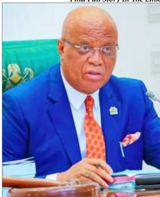
Governor Umo Eno