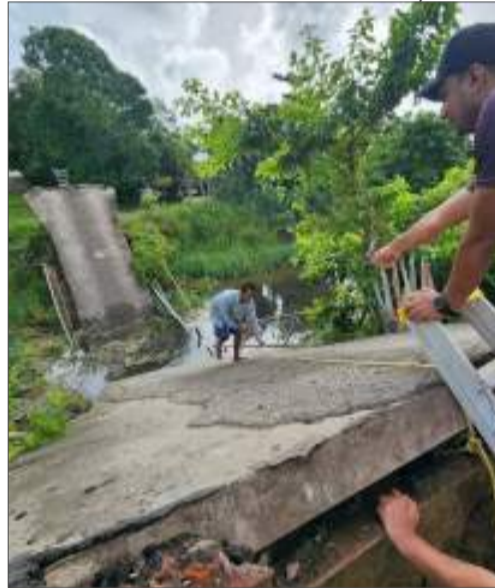
Baro-Katcha bridge collapse