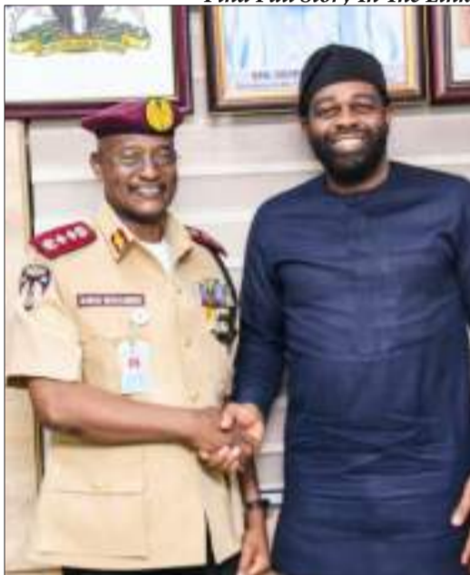
NHIA partners FRSC