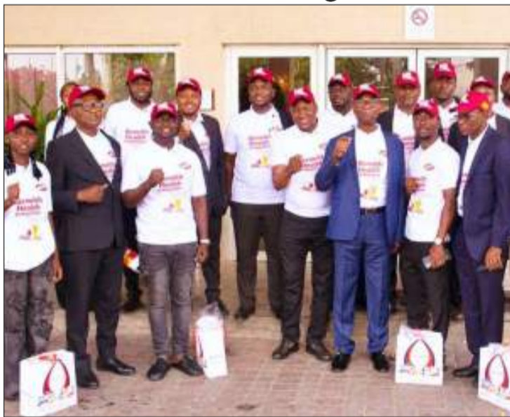
Geneith Health Competition (GHC)