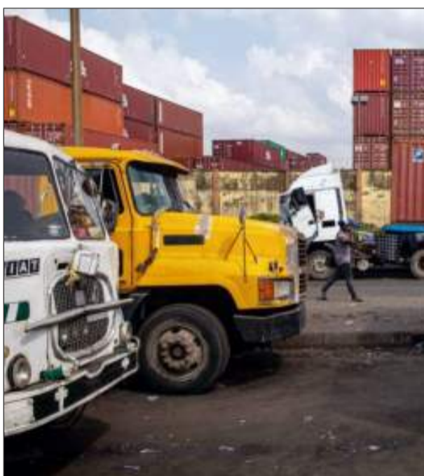
Trucks with containers

There are growing concerns over the continuous underutilisation of approved truck transit parks at the Lagos port access roads by truck operators, contributing to the persistent traffic congestion across the country's maritime corridor.