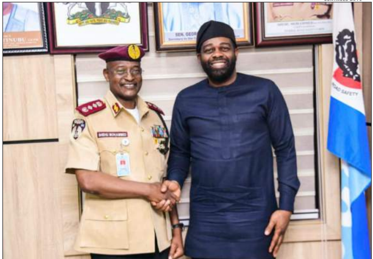
NHIA partners FRSC on crash victims' healthcare access

Stakeholders Praise FG Over Bauchi-Gombe Road Recons'ction P7 FG Orders Contractors Not To Shut Roads Beyond 14 Days P2 Standard Bank Backs Dangote Refinery Expansion Plan P5