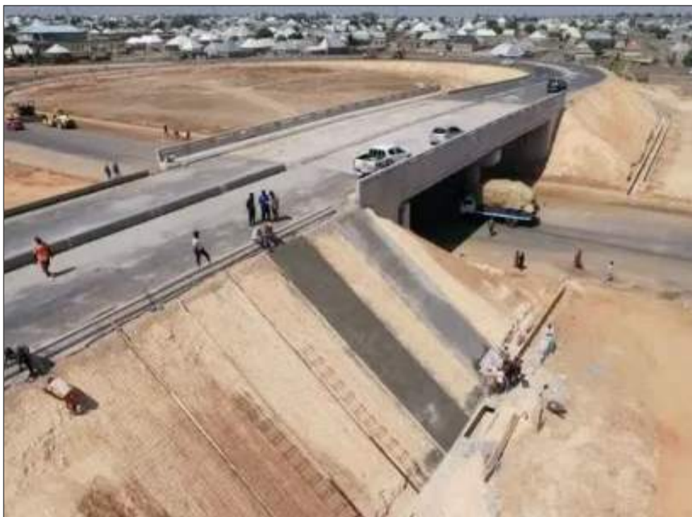
The Bauchi-Gombe road reconstruction