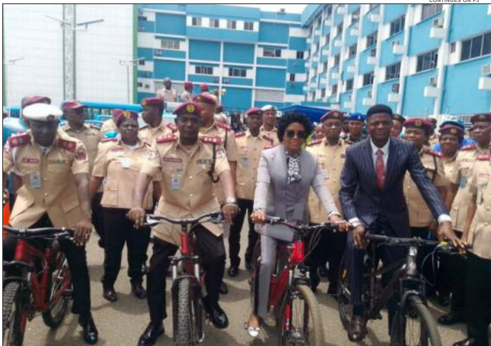
FRSC Officials on bicycles celebrating the World Bicycle Day in Abuja