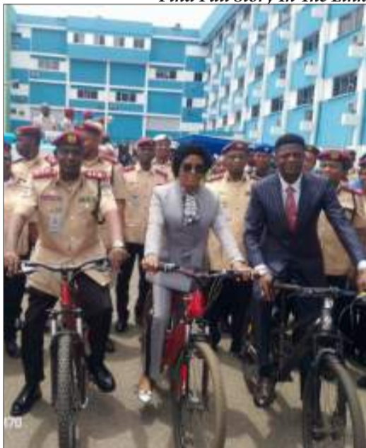
FRSC Celebrates World Bicycle Day