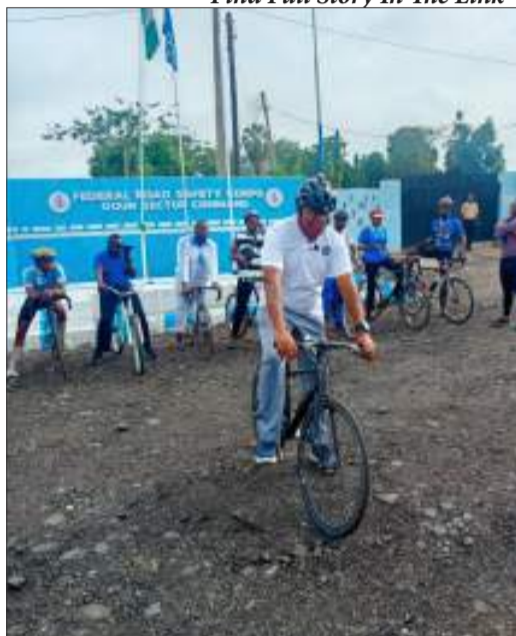
World Bicycle Day