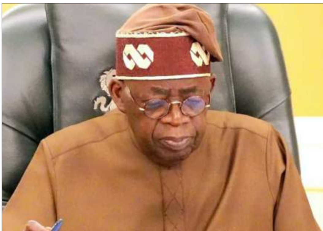
President Bola Tinubu

Customs Service (NCS) faced immense difficulties policing illegal routes, thereby leading to revenue losses.