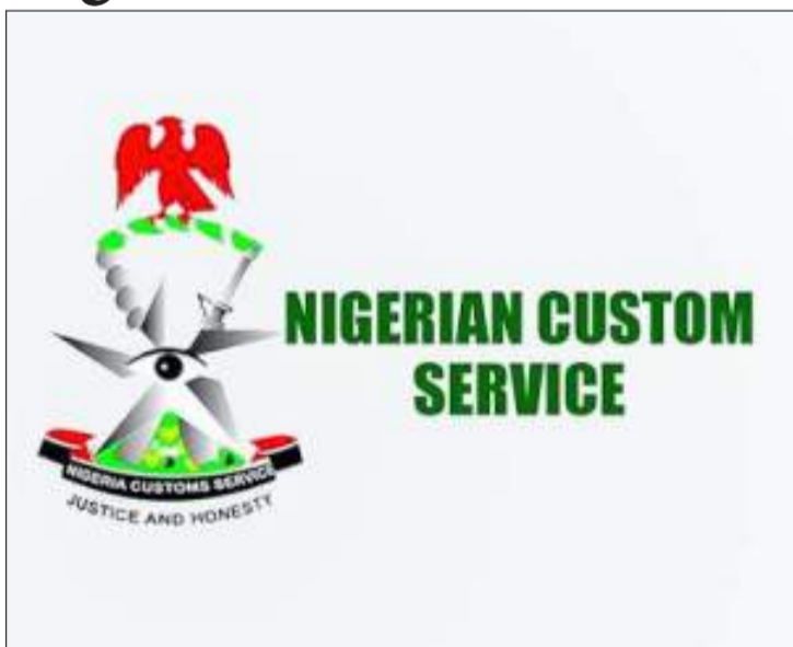
Nigerian Custom Service (NCS)