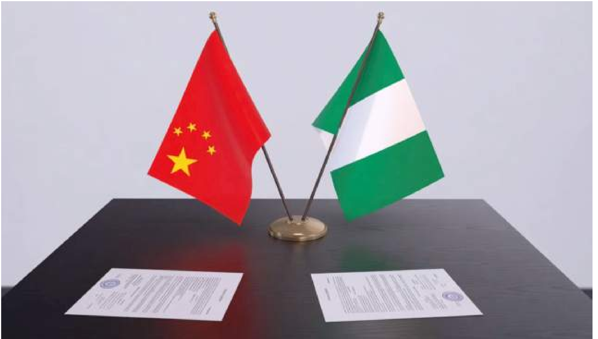
Nigeria, China flag