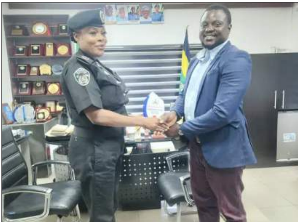
Port Police partners MARAN to boost maritime security