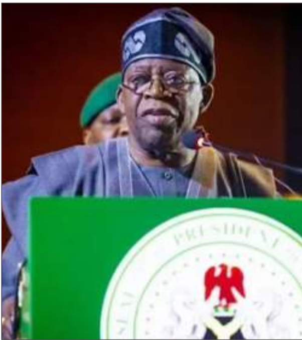
President Bola Tinubu

President Bola Tinubu has commissioned the main carriageways of the Outer Southern Expressway, linking Ring Road 1 Junction to Ring Road 2 Junction in the Federal Capital Territory, describing the project as part of efforts to expand infrastructure and drive economic development in the capital.