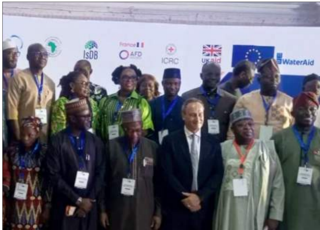
Participants at the Urban Water Supply Sector Reform

states attended the workshop, describing it as evidence of strong national commitment to improving water services.