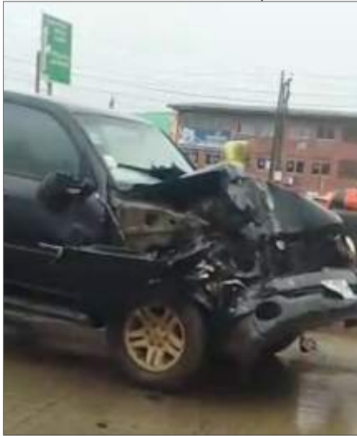
The accidental car