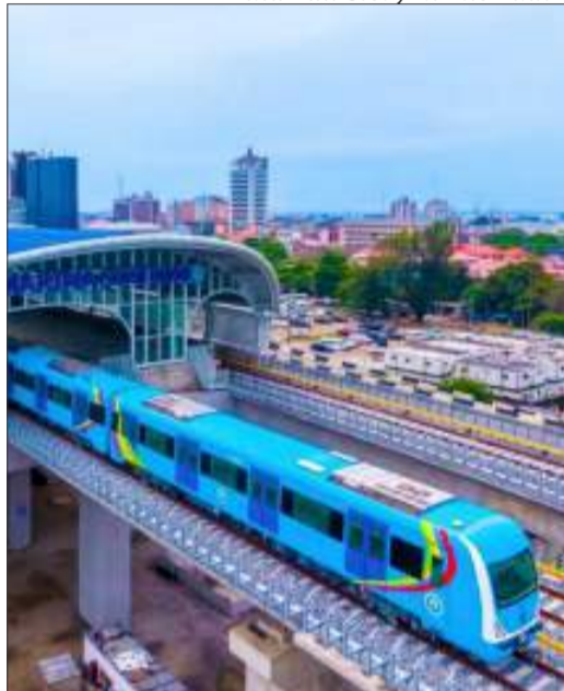
Blue line train