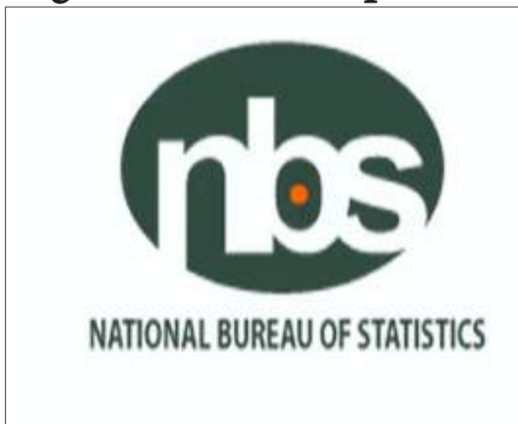
National Bureau of Statistics (NBS)