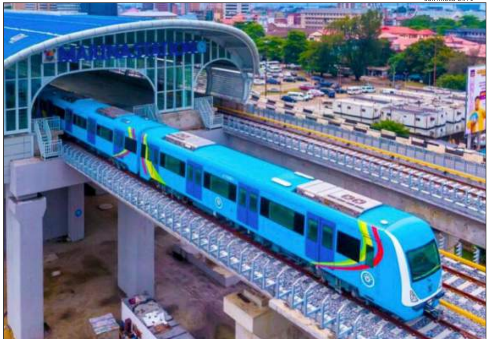
The Blue Line Train